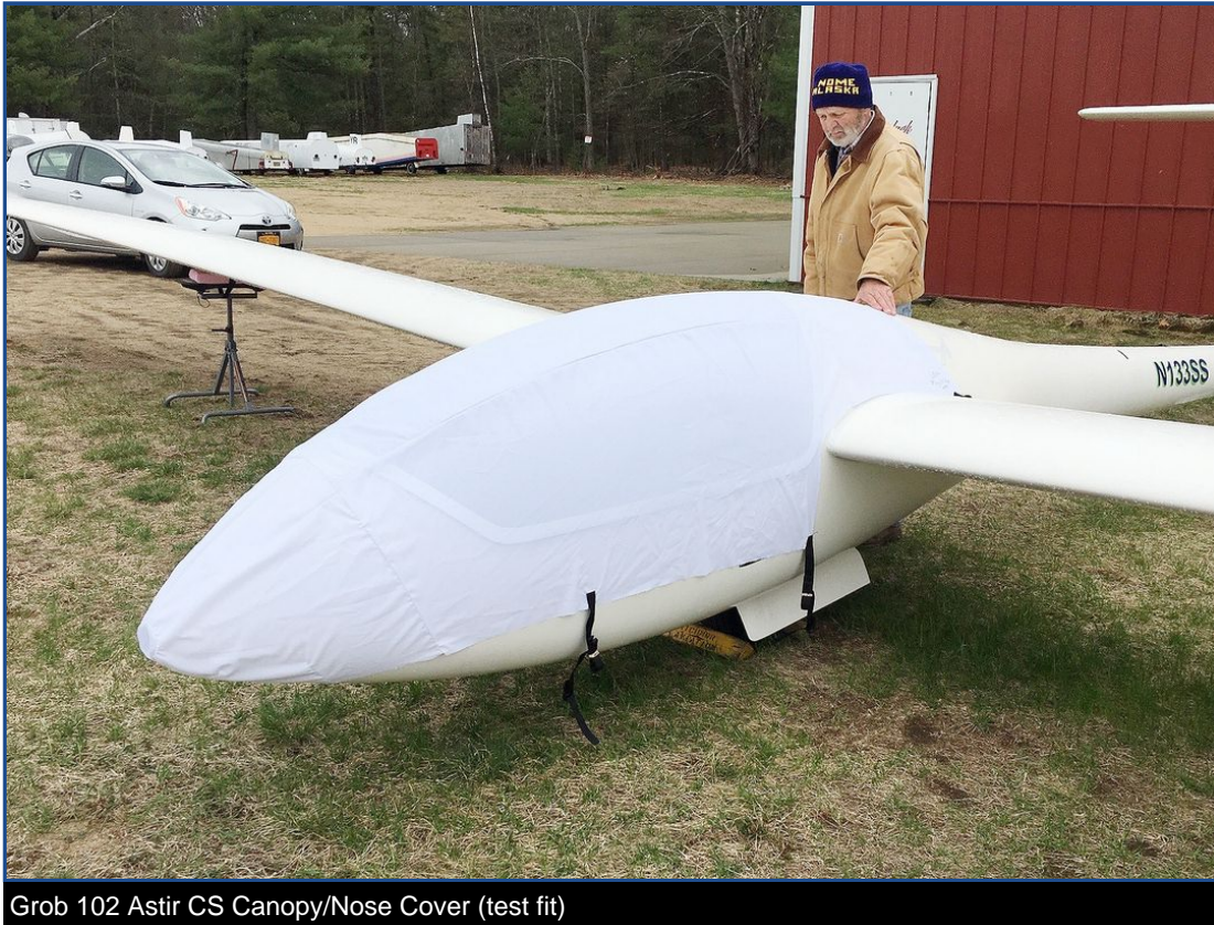
Grob 102 Astir CS Canopy/Nose Cover (test fit)