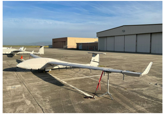
Schempp-Hirth Discus 2B Complete Cover Set