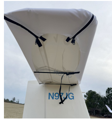
Schempp-Hirth Standard Cirrus Wing & Empennage Covers Schempp-Hirth Ventus 2B Horizontal Stabilizer Cover, test fit cover