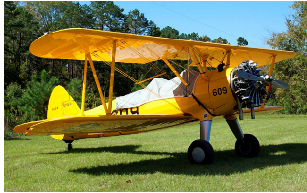
Stearman Canopy Cover