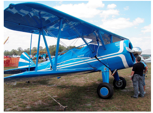
Stearman Canopy Cover (std. color is silver)