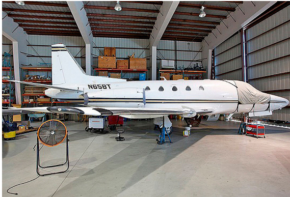
Sabre 40 Cockpit Cover

This cover type is made from Silver Acrylic Sunbrella canvas and is 100% lined with a soft and smooth microfiber. Bruce's Custom Covers developed this material combination especially for aircraft protection. The outer material is medium weight and treated for water resistance, UV resistance and anti-static buildup. The inner lining is a very soft and smooth microfiber to prevent scratching. The material is very reflective, and tests show that the cabin interior temperature can be reduced to near-ambient temperature on the hottest of days. It is water, ice and snow repellent, yet breathable to allow moisture to escape from between the cover and the aircraft surface.