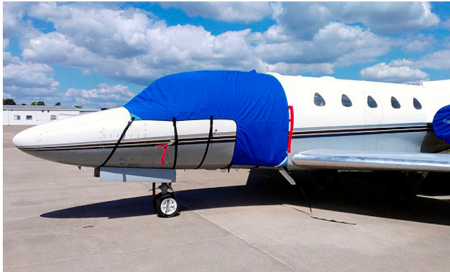
Rockwell Sabre Cockpit/Door Cover

This cover type is made from Silver Acrylic Sunbrella canvas and is 100% lined with a soft and smooth microfiber. Bruce's Custom Covers developed this material combination especially for aircraft protection. The outer material is medium weight and treated for water resistance, UV resistance and anti-static buildup. The inner lining is a very soft and smooth microfiber to prevent scratching. The material is very reflective, and tests show that the cabin interior temperature can be reduced to near-ambient temperature on the hottest of days. It is water, ice and snow repellent, yet breathable to allow moisture to escape from between the cover and the aircraft surface.