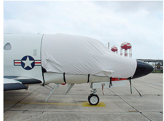
Sabre 40 Cockpit Cover