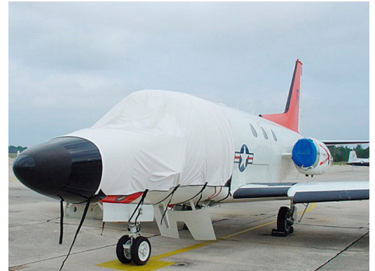
Sabre 40 Cockpit and Engine Covers set