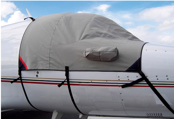
Sabre Cockpit Cover