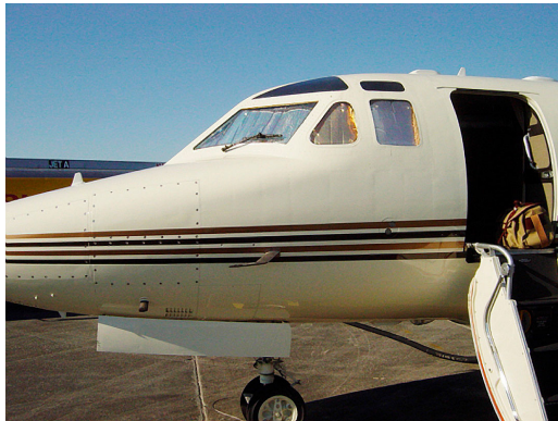
Sabre Cockpit HeatShields Set

Heatshields are interior sunshades for an aircraft's windows or canopy glass. The product is a unique composite of closed-cell foam with a silver mylar finish. The semi-rigid design is stiff enough to stand along the inside of the windshield using sun visors or window framing. It folds up flat and easily stores in the included storage sleeve. Some designs may require velcro and suction cups. A Heatshield is an excellent short-term remedy for cockpit overheating.