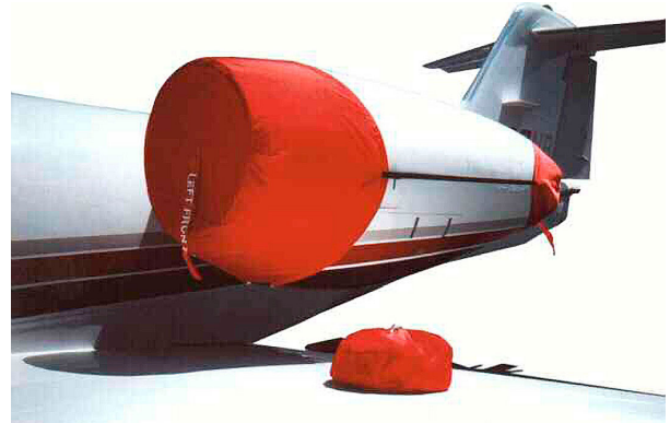
Lear 30 Tri-Fold Engine Cover