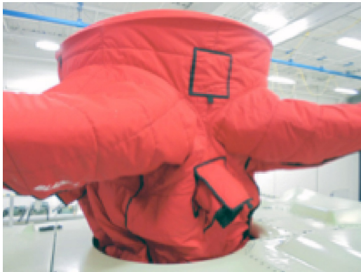
Sikorsky S-92 Main Rotor Mast Cover, Insulated, w/Heater Hose Inlets

shorter useful life if used continuously outside than the all-year use material.