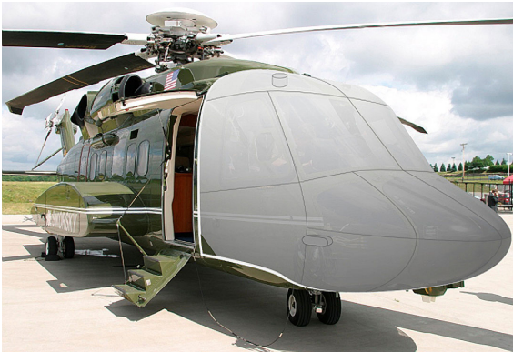
Sikorsky S-92 Windshield/Nose, Blade, Rotor Hub & Tail Rotor Covers