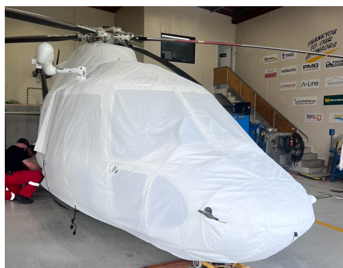
Sikorsky S76C Forward Canopy Cover, Engine Cover (test fit covers)

Travel Covers are made with Silver Solution-Dyed Polyester fabric and fully lined over the entire cover. The material is lightweight and more compact for easy stowage in the aircraft. The polyester material is water resistant, but only intended for occasional use outside. We also have an ultra lightweight material available for fitted hangar dust covers. For daily outdoor use, the non-travel Sunbrella Cover is the best choice.