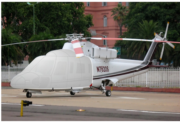
Sikorsky S76 Bubble Cover (Forward Canopy Cover)