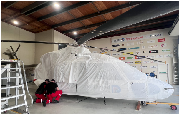
Sikorsky S76C Forward Canopy Cover, Engine Cover (test fit covers)