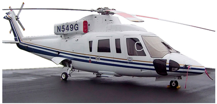
Sikorsky S76 Snap-On Windshield Cover