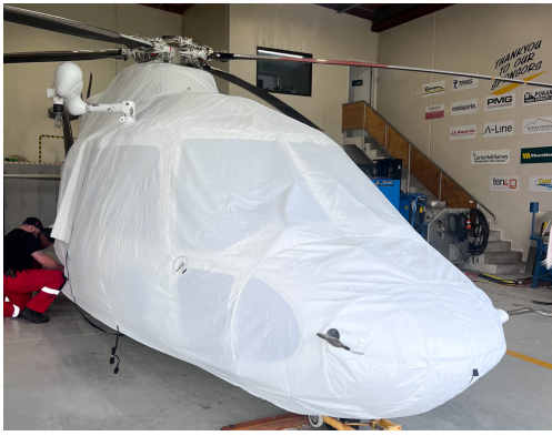
Sikorsky S76C Forward Canopy Cover, Engine Cover (test fit covers)