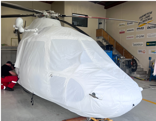
Sikorsky S76C Forward Canopy Cover, Engine Cover (test fit covers)