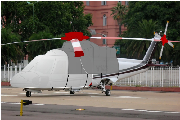
S76 Forward Fuselage, Engine, Main & Tail Rotor Hub Covers (illustration)

WINTER USE MATERIAL - Made with Solution-Dyed Polyester fabric, this option is intended for seasonal use to aid in deicing, rain mitigation, or for occasional travel. The material is lighter and more compact, but more susceptible to UV damage and may have a shorter useful life if used continuously outside than the all-year use material.