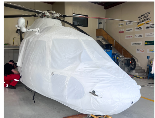
Sikorsky S76C Forward Canopy Cover, Engine Cover (test fit covers)