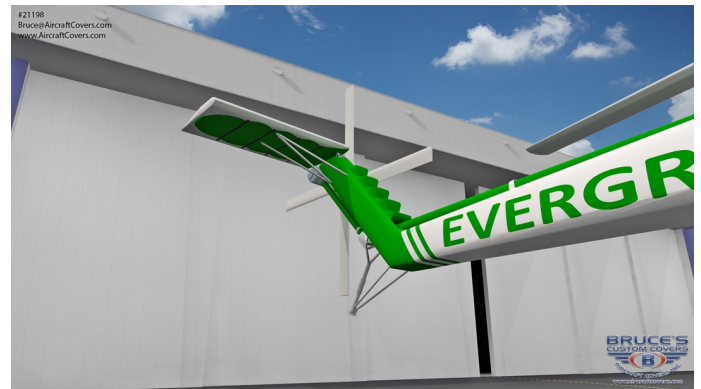
Sikorsky S-64 Skycrane, CH-54 Tarhe Insulated Engine, Rotor Sikorsky S-64 Canopy/Nose, Engine Area, Blade, Rotor, Tail Rotor Hub, Tailboom, Stabilizer & Tail Rotor Covers (illustration)