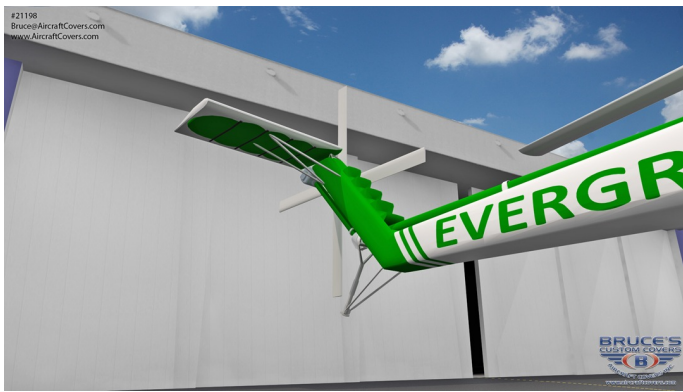
Sikorsky S-64 Canopy/Nose, Engine Area, Blade, Rotor, Tail Rotor Covers (illustration)