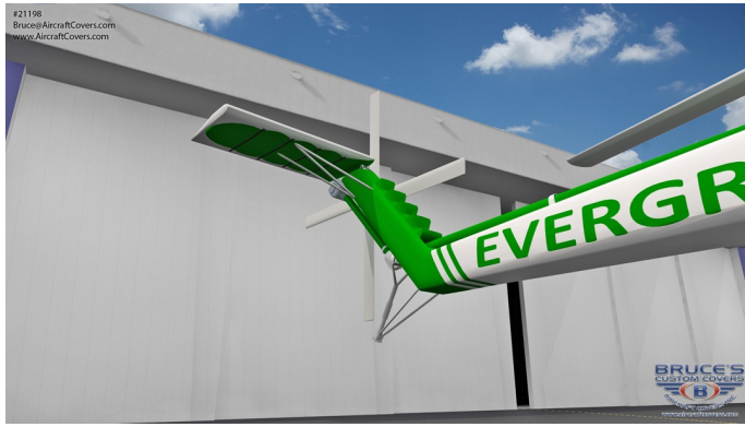
Sikorsky S-64 Canopy/Nose, Engine Area, Blade, Rotor, Tail Rotor Covers (illustration)