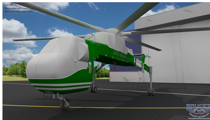
Sikorsky S-64 Canopy/Nose, Engine Area, Blade, Rotor, Tail Rotor Covers (illustration)

Travel Covers are made with Silver Solution-Dyed Polyester fabric and fully lined over the entire cover. The material is lightweight and more compact for easy storage in the aircraft. The polyester material is water resistant, but only intended for occasional use outside. We also have an ultra lightweight material available for fitted hangar dust covers. For daily outdoor use, the non-travel Sunbrella Cover is the best choice.