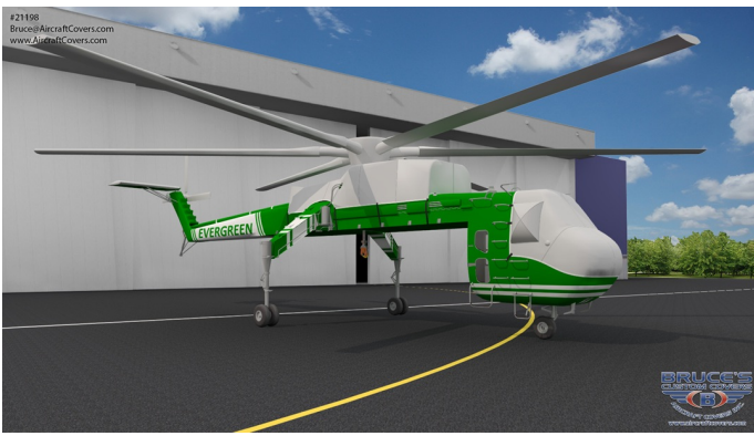
Sikorsky S-64 Canopy/Nose, Engine Area, Blade, Rotor, Tail Rotor Covers (illustration)