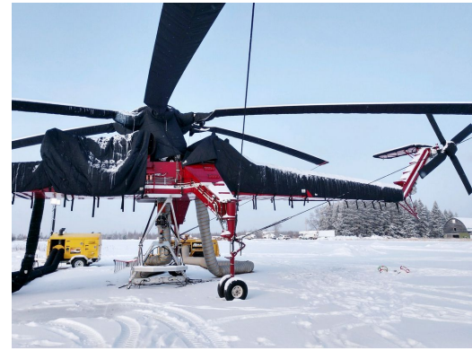
Sikorsky S-64 Canopy/Nose, Engine Area, Blade, Rotor, Tail Rotor Sikorsky S-64 Skycrane, CH-54 Tarhe Insulated Engine, Rotor Hub, Tailboom, Stabilizer & Tail Rotor Covers (illustration)