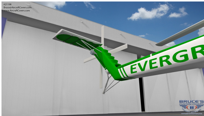
Sikorsky S-64 Canopy/Nose, Engine Area, Blade, Rotor, Tail Rotor Covers (illustration)

The Tailboom Cover details vary by model, but generally the helicopter tail boom cover encloses the tail boom from the "bottleneck" to the aft end. They usually also cover the horizontal stabilizers, and are custom made to allow for antennae, lights, and other protrusions. They attach with straps underneath the tail boom. Covers for the vertical and horizontal stabilizers are also available separately. Specific information for each model is available on request.