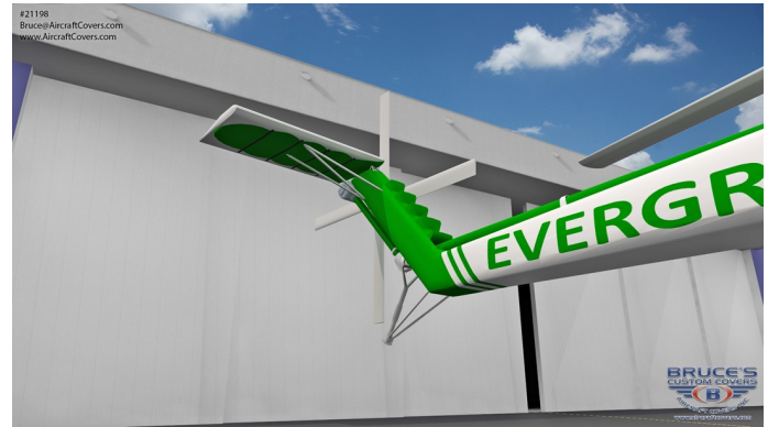
Sikorsky S-64 Skycrane, CH-54 Tarhe Insulated Engine, Rotor Hub, Tailboom, Stabilizer & Tail Rotor Covers