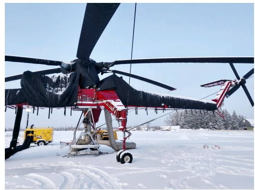
Sikorsky S-64 Skycrane, CH-54 Tarhe Insulated Engine, Rotor Hub, Tailboom, Stabilizer & Tail Rotor Covers