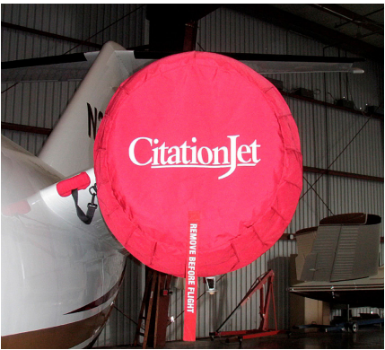
Cessna Citation Engine Cover Set