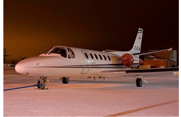
Cessna Citation 550 Engine Cover Set