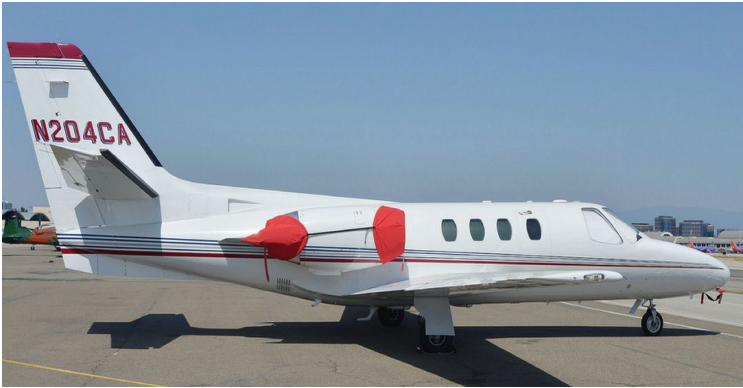
Cessna Citation Engine Covers and Heatshields