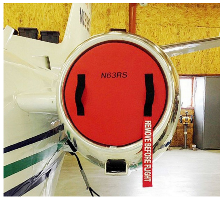
Cessna Citation S-550 Intake Plugs