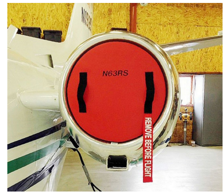
Cessna Citation S-550 Intake Plugs