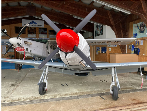
SW-51 Mustang Engine Cover

This cover type is made from Silver Acrylic Sunbrella canvas and is 100% lined with a soft and smooth microfiber. Bruce's Custom Covers developed this material combination especially for aircraft protection. The outer material is medium weight and treated for water resistance, UV resistance and anti-static buildup. The inner lining is a very soft and smooth microfiber to prevent scratching. The material is very reflective, and tests show that the cabin interior temperature can be reduced to near-ambient temperature on the hottest of days. It is water, ice and snow repellent, yet breathable to allow moisture to escape from between the cover and the aircraft surface.