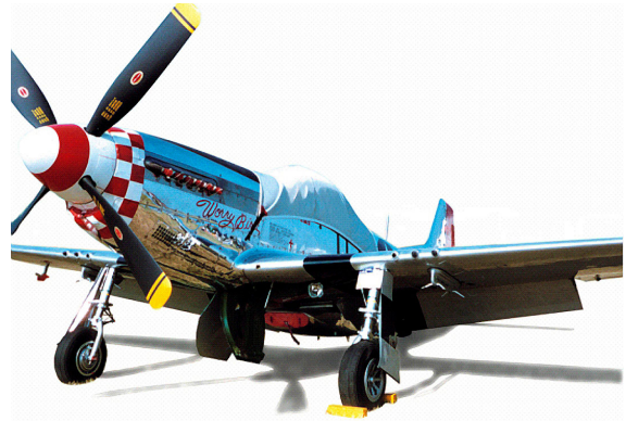
Canopy Cover, Belly & Chin Scoop Plugs