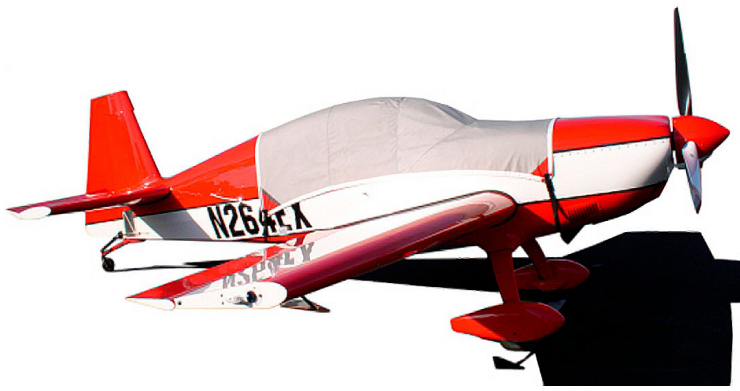
Canopy Cover for the Extra 300