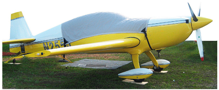
Xtremeair Canopy Cover