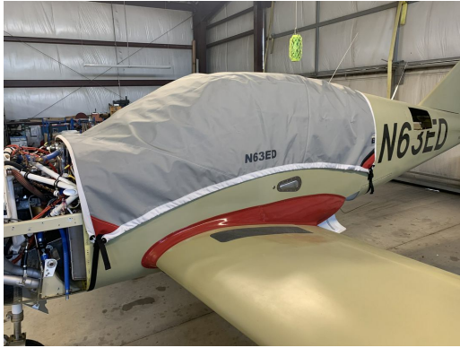
Swearingen SX300 Travel Weight Canopy Cover

Travel Covers are made with Silver Solution-Dyed Polyester fabric and only lined over the windshield to save weight. The material is lightweight and more compact for easy stowage in the aircraft. The polyester material is water resistant, but only intended for occasional use outside. We also have an ultra lightweight material available for fitted hangar dust covers. For daily outdoor use, the non-travel Sunbrella Cover is the best choice.