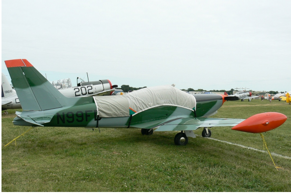
Siai Marchetti SF260 Canopy Cover with aft extension

This cover type is made from Silver Acrylic Sunbrella canvas and is 100% lined with a soft and smooth microfiber. Bruce's Custom Covers developed this material combination especially for aircraft protection. The outer material is medium weight and treated for water resistance, UV resistance and anti-static buildup. The inner lining is a very soft and smooth microfiber to prevent scratching. The material is very reflective, and tests show that the cabin interior temperature can be reduced to near-ambient temperature on the hottest of days. It is water, ice and snow repellent, yet breathable to allow moisture to escape from between the cover and the aircraft surface.