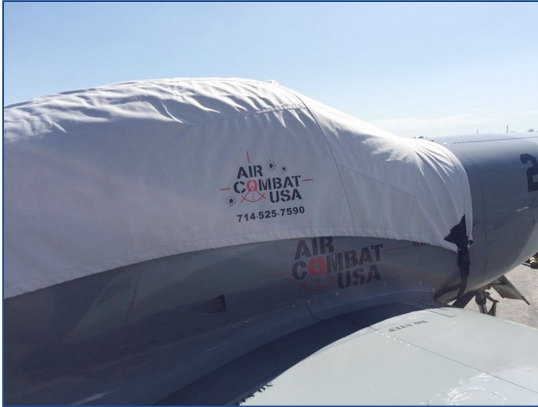
1974 Siai-Marchetti SF 260B Canopy Cover with customized Imprint