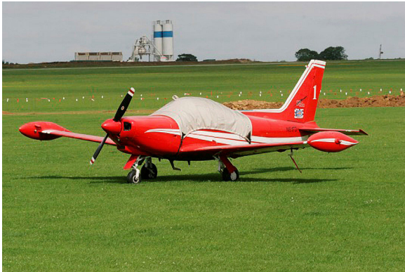
Siai Marchetti SF260 Canopy Cover

Travel Covers are made with Silver Solution-Dyed Polyester fabric and only lined over the windshield to save weight. The material is lightweight and more compact for easy stowage in the aircraft. The polyester material is water resistant, but only intended for occasional use outside. We also have an ultra lightweight material available for fitted hangar dust covers. For daily outdoor use, the non-travel Sunbrella Cover is the best choice.