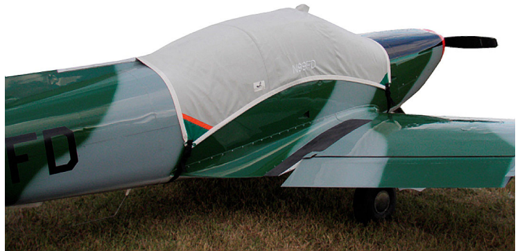
Standard Canopy Cover