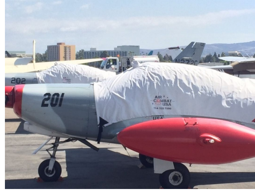
1974 Siai-Marchetti SF 260B Canopy Cover with customized Imprint