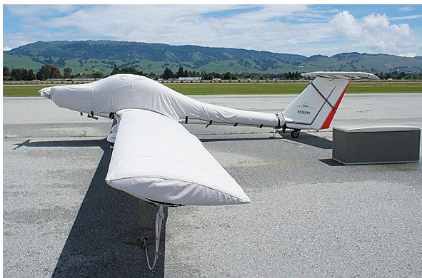
Grob 109 Canopy/Engine w/ extension to tail, Wing, Stabilizer & Prop/Spinner Covers

This cover type is made from Silver Acrylic Sunbrella canvas and is 100% lined with a soft and smooth microfiber. Bruce's Custom Covers developed this material combination especially for aircraft protection. The outer material is medium weight and treated for water resistance, UV resistance and anti-static buildup. The inner lining is a very soft and smooth microfiber to prevent scratching. The material is very reflective, and tests show that the cabin interior temperature can be reduced to near-ambient temperature on the hottest of days. It is water, ice and snow repellent, yet breathable to allow moisture to escape from between the cover and the aircraft surface.