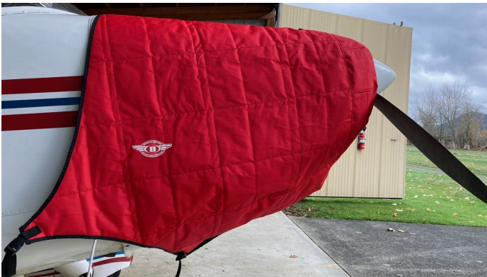
Stinson 108 Insulated Engine Cover

This cover type is made from Silver Acrylic Sunbrella canvas and is 100% lined with a soft and smooth microfiber. Bruce's Custom Covers developed this material combination especially for aircraft protection. The outer material is medium weight and treated for water resistance, UV resistance and anti-static buildup. The inner lining is a very soft and smooth microfiber to prevent scratching. The material is very reflective, and tests show that the cabin interior temperature can be reduced to near-ambient temperature on the hottest of days. It is water, ice and snow repellent, yet breathable to allow moisture to escape from between the cover and the aircraft surface.