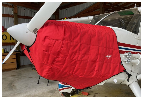
Stinson 108 Insulated Engine Cover