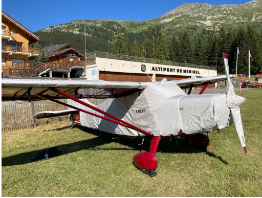
Stinson 108-3 Voyager Cover Set

WINTER USE MATERIAL - Made with Solution-Dyed Polyester fabric, this option is intended for seasonal use to aid in deicing, rain mitigation, or for occasional travel. The material is lighter and more compact, but more susceptible to UV damage and may have a shorter useful life if used continuously outside than the all-year use material.