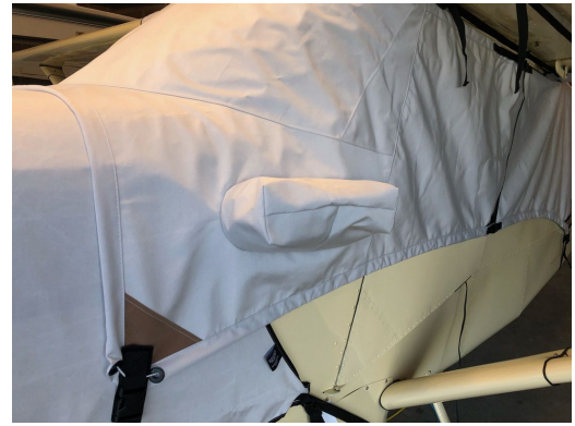
Stinson 108 Over-Top Canopy Cover, Engine Cover