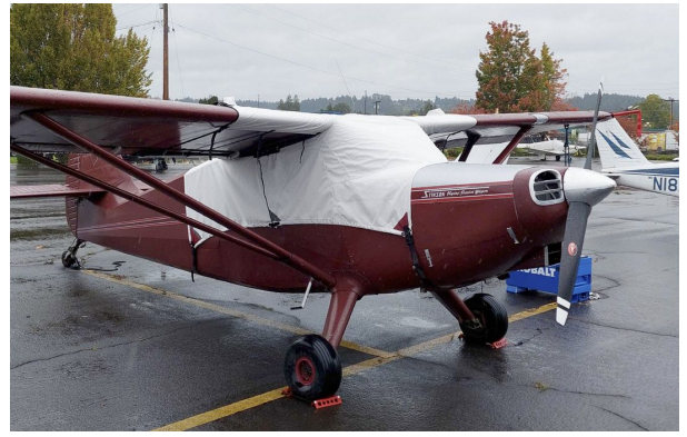
Stinson 108 Canopy Cover, ext. to cover gas caps