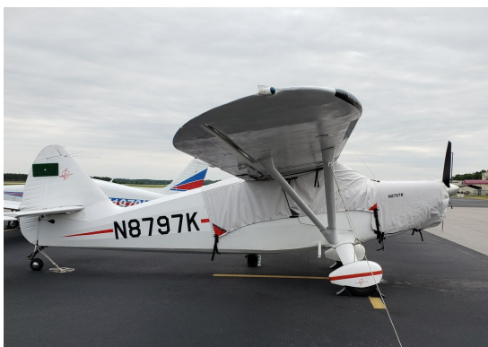
Stinson 108 Voyager Canopy Cover with wing extensions, Engine Cover

This cover type is made from Silver Acrylic Sunbrella canvas and is 100% lined with a soft and smooth microfiber. Bruce's Custom Covers developed this material combination especially for aircraft protection. The outer material is medium weight and treated for water resistance, UV resistance and anti-static buildup. The inner lining is a very soft and smooth microfiber to prevent scratching. The material is very reflective, and tests show that the cabin interior temperature can be reduced to near-ambient temperature on the hottest of days. It is water, ice and snow repellent, yet breathable to allow moisture to escape from between the cover and the aircraft surface.