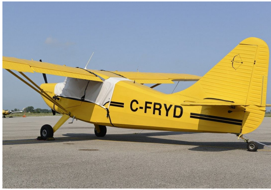
Stinson 108 Voyager Canopy Cover, Wrap-Around Type