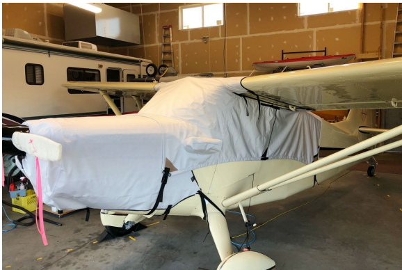
Stinson 108 Over-Top Canopy Cover, Engine Cover