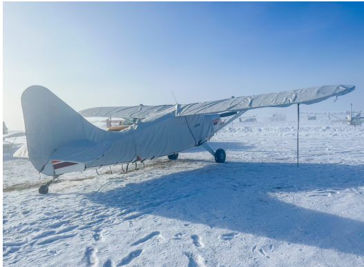
Stinson 108 Winter Cover Set