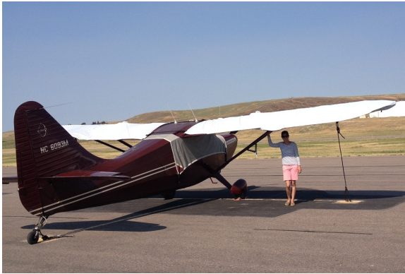
Stinson 108 Canopy Cover & Wing Covers

This cover type is made from Silver Acrylic Sunbrella canvas and is 100% lined with a soft and smooth microfiber. Bruce's Custom Covers developed this material combination especially for aircraft protection. The outer material is medium weight and treated for water resistance, UV resistance and anti-static buildup. The inner lining is a very soft and smooth microfiber to prevent scratching. The material is very reflective, and tests show that the cabin interior temperature can be reduced to near-ambient temperature on the hottest of days. It is water, ice and snow repellent, yet breathable to allow moisture to escape from between the cover and the aircraft surface.