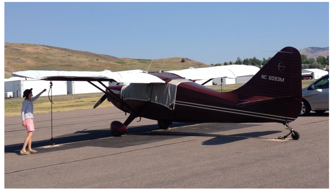
Stinson 108 Canopy Cover & Wing Covers