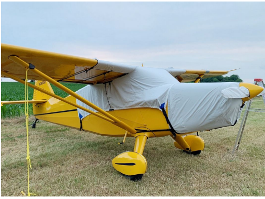
Stinson 108-1 Canopy cover, over-top, extends over gas caps