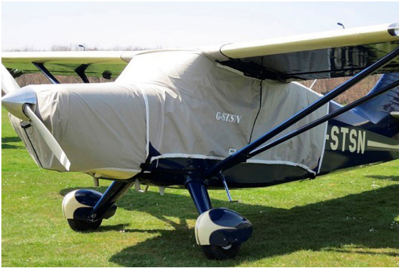
Stinson 108 Canopy & Engine Cover