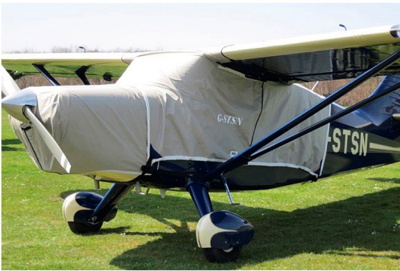
Stinson 108 Canopy & Engine Cover

This cover type is made from Silver Acrylic Sunbrella canvas and is 100% lined with a soft and smooth microfiber. Bruce's Custom Covers developed this material combination especially for aircraft protection. The outer material is medium weight and treated for water resistance, UV resistance and anti-static buildup. The inner lining is a very soft and smooth microfiber to prevent scratching. The material is very reflective, and tests show that the cabin interior temperature can be reduced to near-ambient temperature on the hottest of days. It is water, ice and snow repellent, yet breathable to allow moisture to escape from between the cover and the aircraft surface.