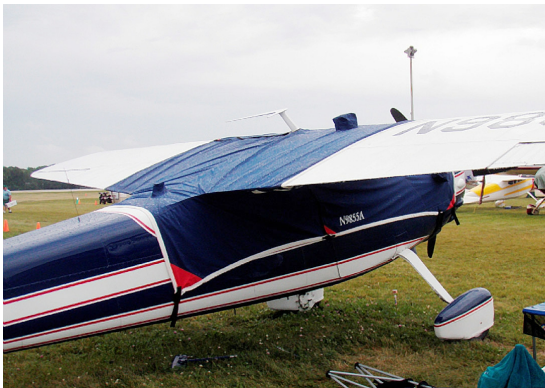
Cessna 195 Canopy Cover, extended forward and over gas caps