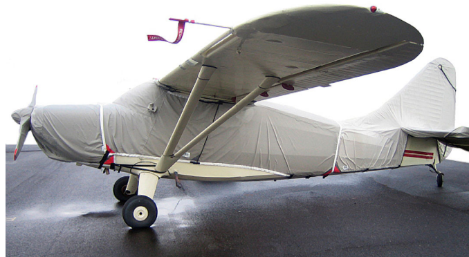
Stinson 108 Canopy, Engine, Prop & Empennage Covers

Stinson S-10 & S-10A Models Pitot Tube Covers , NOT HEAT RESISTANT TYPE, are made of Naugahyde vinyl, and are designed to cover the entire pitot assembly. Slipping over the tube, the cover tightens around the base with a Velcro strap detail. A "Remove Before Flight" streamer is attached to the cover. Heat Resistant Pitot Covers are an upgrade to this design, and help prevent the pitot cover from melting onto the tube if the pitot heat is accidentally turned on while installed. If you want the set tethered together, please let us know.