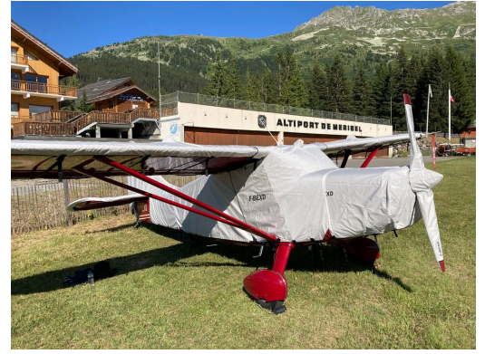
Stinson 108-3 Voyager Cover Set