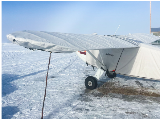
Stinson 108 Winter Cover Set