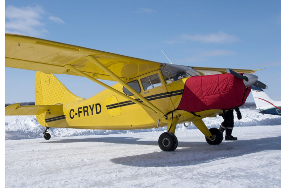
Stinson 108 Insulated Engine Cover, not fully enclosed