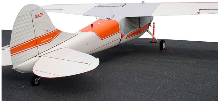
Cessna 195 Over-Top Canopy, Engine & Prop Covers

The material is very reflective, and tests show that the cabin interior temperature can be reduced to near-ambient temperature on the hottest of days. It is water, ice and snow repellent, yet breathable to allow moisture to escape from between the cover and the aircraft surface.