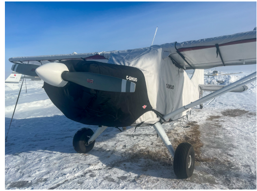
Stinson 108 Winter Cover Set