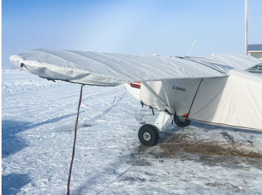
Stinson 108 Winter Cover Set

This cover type is made from Silver Acrylic Sunbrella canvas and is 100% lined with a soft and smooth microfiber. Bruce's Custom Covers developed this material combination especially for aircraft protection. The outer material is medium weight and treated for water resistance, UV resistance and anti-static buildup. The inner lining is a very soft and smooth microfiber to prevent scratching. The material is very reflective, and tests show that the cabin interior temperature can be reduced to near-ambient temperature on the hottest of days. It is water, ice and snow repellent, yet breathable to allow moisture to escape from between the cover and the aircraft surface.