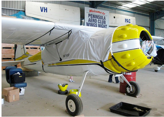
Cessna 195 Canopy Cover, over-top, 24" fwd ext to cover cowl ring gap, gas cap ext.

The material is very reflective, and tests show that the cabin interior temperature can be reduced to near-ambient temperature on the hottest of days. It is water, ice and snow repellent, yet breathable to allow moisture to escape from between the cover and the aircraft surface.