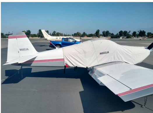
Van's RV-6 Extended Canopy/Engine Cover

This cover type is made from Silver Acrylic Sunbrella canvas and is 100% lined with a soft and smooth microfiber. Bruce's Custom Covers developed this material combination especially for aircraft protection. The outer material is medium weight and treated for water resistance, UV resistance and anti-static buildup. The inner lining is a very soft and smooth microfiber to prevent scratching. The material is very reflective, and tests show that the cabin interior temperature can be reduced to near-ambient temperature on the hottest of days. It is water, ice and snow repellent, yet breathable to allow moisture to escape from between the cover and the aircraft surface.