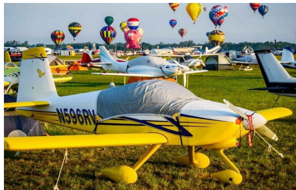
Van's Aircraft RV-9 Travel Cover, Light Weight Travel Canopy Cover