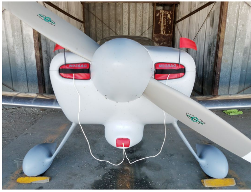
Van's RV-9 Engine Inlet Plugs