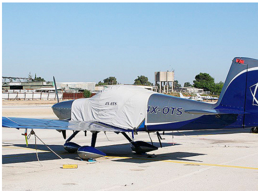
Van's RV-9 Extended Canopy Cover

This cover type is made from Silver Acrylic Sunbrella canvas and is 100% lined with a soft and smooth microfiber. Bruce's Custom Covers developed this material combination especially for aircraft protection. The outer material is medium weight and treated for water resistance, UV resistance and anti-static buildup. The inner lining is a very soft and smooth microfiber to prevent scratching. The material is very reflective, and tests show that the cabin interior temperature can be reduced to near-ambient temperature on the hottest of days. It is water, ice and snow repellent, yet breathable to allow moisture to escape from between the cover and the aircraft surface.