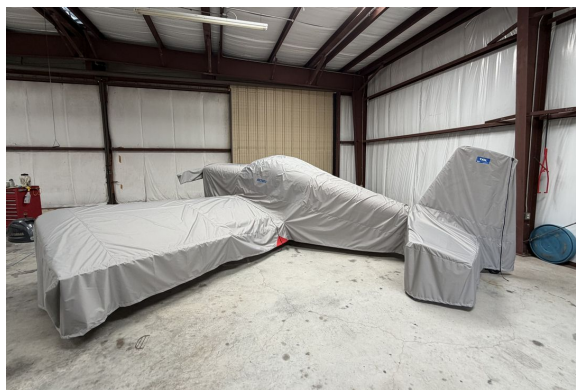
Van's Aircraft RV-7A Dust Cover

Some high value aircraft end up logging lots of hangar time, and become dust magnets in the process. A high quality, well fitting dust cover provides easy assurance that the aircraft's surfaces remain clean and free of grit and grime. Available in a large variety of colors, each dust cover is custom made according to aircraft details and customer preferences. Fire retardant fabrics are also available.