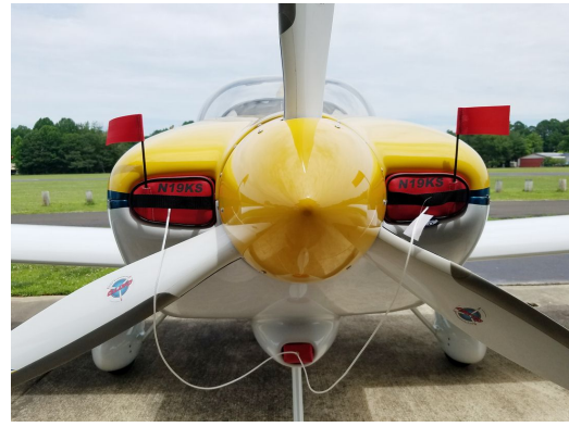
Van's RV-9A Engine Inlet Plugs