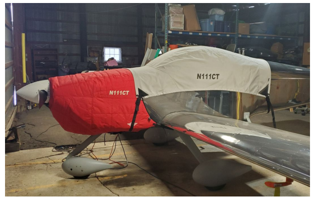
Van's RV-9 Insulated Engine Cover