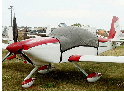
Van's RV-9 Travel Canopy Cover