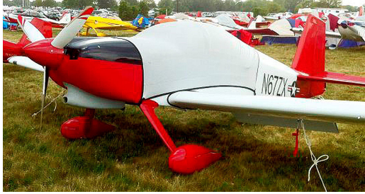
Light Weight Fitted Hangar Dust Cover

occasional use outside. We also have an ultra lightweight material available for fitted hangar dust covers. For daily outdoor use, the non-travel Sunbrella Cover is the best choice.