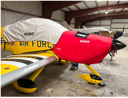
Van's Aircraft RV-7/7A Insulated Engine Cover