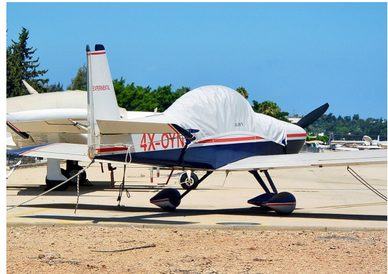
Van's RV-8 Canopy Cover