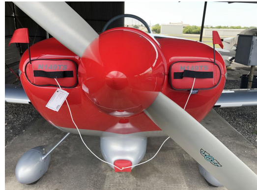
Van's RV-8 Engine Plugs, set of 3