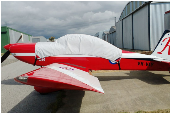
Van's RV-8 Belly Strap Type Canopy Cover

This cover type is made from Silver Acrylic Sunbrella canvas and is 100% lined with a soft and smooth microfiber. Bruce's Custom Covers developed this material combination especially for aircraft protection. The outer material is medium weight and treated for water resistance, UV resistance and anti-static buildup. The inner lining is a very soft and smooth microfiber to prevent scratching. The material is very reflective, and tests show that the cabin interior temperature can be reduced to near-ambient temperature on the hottest of days. It is water, ice and snow repellent, yet breathable to allow moisture to escape from between the cover and the aircraft surface.