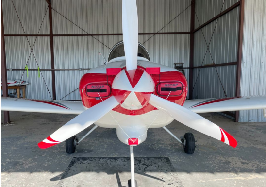
Van's RV-8 Engine Inlet Plugs

Engine Inlet Plugs are custom fit for your Van's Aircraft RV-8/8A intakes, made with heavy-duty vinyl material, and stuffed with a single block of sculpted urethane foam. Each plug has a zipper that allows the foam to be removed and dried if necessary. Engine plugs have warning flags that are visible from the cockpit or 'remove before flight' streamers sewn onto the face of the plugs. Most plugs are imprinted with the aircraft registration number in black for an extra charge. Storage bag NOT included. Engine plugs may be inserted after flight when the engine is still warm. Engine Inlet Plugs are commonly referred to as Cowl Plugs, Intake Plugs, Cowl Blocks, Engine Blocks, and Engine Bungs.