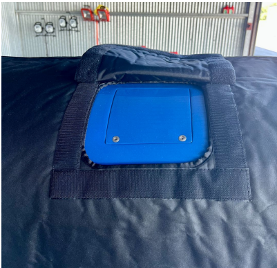
Van's RV8 Insulated Engine Cover