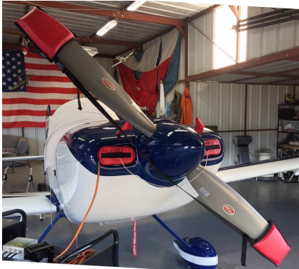
Van's RV-8 Engine Plugs, Prop Tip Protectors