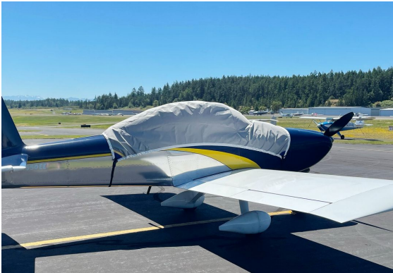
RV-8A Travel Canopy Cover

Travel Covers are made with Silver Solution-Dyed Polyester fabric and only lined over the windshield to save weight. The material is lightweight and more compact for easy stowage in the aircraft. The polyester material is water resistant, but only intended for occasional use outside. We also have an ultra lightweight material available for fitted hangar dust covers. For daily outdoor use, the non-travel Sunbrella Cover is the best choice.