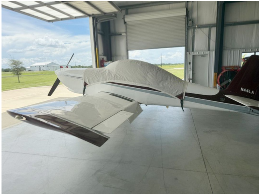
Van's Aircraft RV-8 Travel Canopy Cover