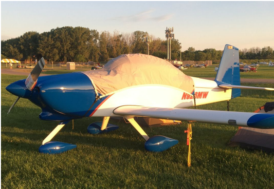
Van's' RV-8 Light Weight Travel Cover

Travel Covers are made with Silver Solution-Dyed Polyester fabric and only lined over the windshield to save weight. The material is lightweight and more compact for easy stowage in the aircraft. The polyester material is water resistant, but only intended for occasional use outside. We also have an ultra lightweight material available for fitted hangar dust covers. For daily outdoor use, the non-travel Sunbrella Cover is the best choice.