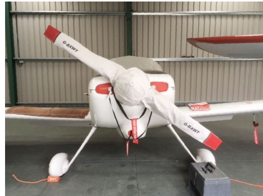
Van's RV-6 Prop/Spinner Cover