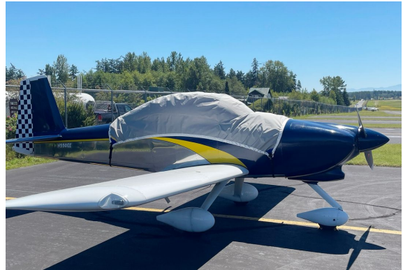
RV-8A Travel Canopy Cover