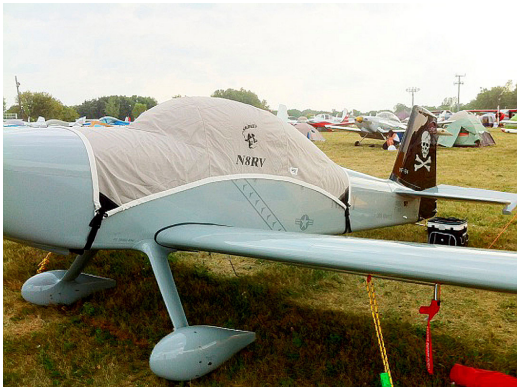
Van's RV-8 Canopy Cover