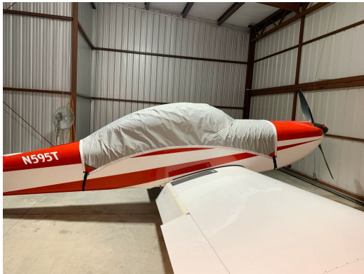
Van's RV-8 Canopy Cover

This cover type is made from Silver Acrylic Sunbrella canvas and is 100% lined with a soft and smooth microfiber. Bruce's Custom Covers developed this material combination especially for aircraft protection. The outer material is medium weight and treated for water resistance, UV resistance and anti-static buildup. The inner lining is a very soft and smooth microfiber to prevent scratching. The material is very reflective, and tests show that the cabin interior temperature can be reduced to near-ambient temperature on the hottest of days. It is water, ice and snow repellent, yet breathable to allow moisture to escape from between the cover and the aircraft surface.