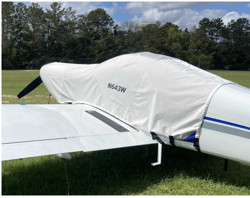
Van's RV-7 Extended Canopy/Engine Cover