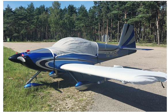
Van's RV-7/7A Travel and Wing Covers