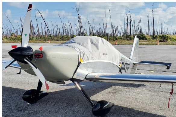
Van's RV-7 Canopy Cover, Engine Plugs