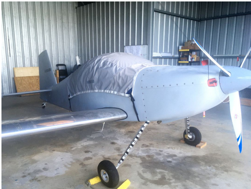
Van's RV-7 Travel Cover, Light Weight Canopy Cover

Travel Covers are made with Silver Solution-Dyed Polyester fabric and only lined over the windshield to save weight. The material is lightweight and more compact for easy stowage in the aircraft. The polyester material is water resistant, but only intended for occasional use outside. We also have an ultra lightweight material available for fitted hangar dust covers. For daily outdoor use, the non-travel Sunbrella Cover is the best choice.