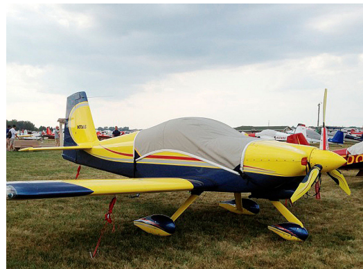
Van's RV-7 Canopy Cover & Engine Inlet Plugs