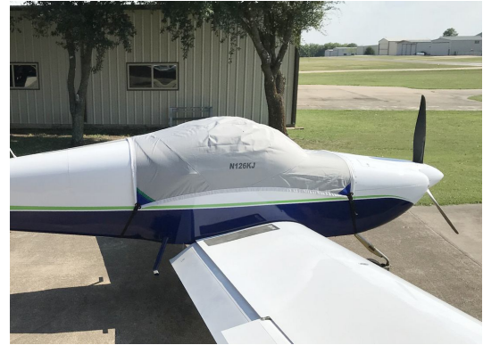
Van's RV-9A Travel Weight Canopy Cover