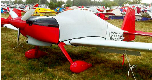
Light Weight Fitted Hangar Dust Cover