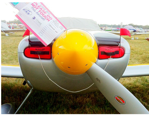
Vans's RV-7 Engine Engine Inlet Plugs