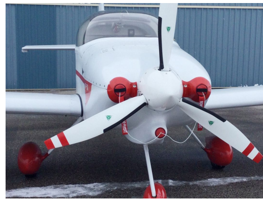
Van's RV-7 Engine Inlet Plugs, Sam James Cowling (Set of 3)