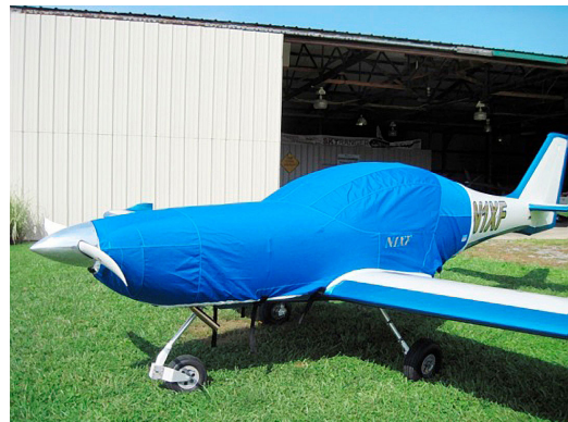
Arion Lightning Extended Canopy/Engine Cover