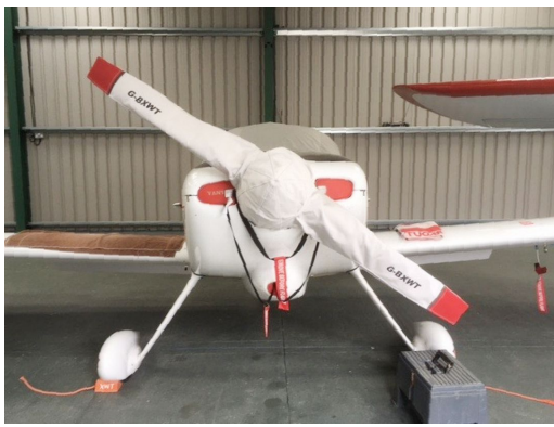
Van's RV-6 Prop/Spinner Cover