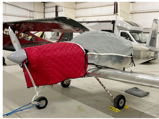
Vans RV-7 Travel Canopy Cover, Hangar Blanket