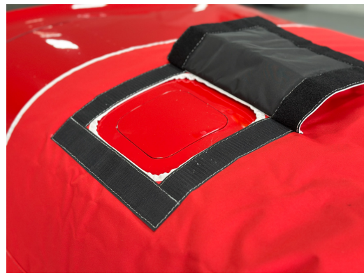
Van's RV-9A Insulated Engine Cover with oil door access