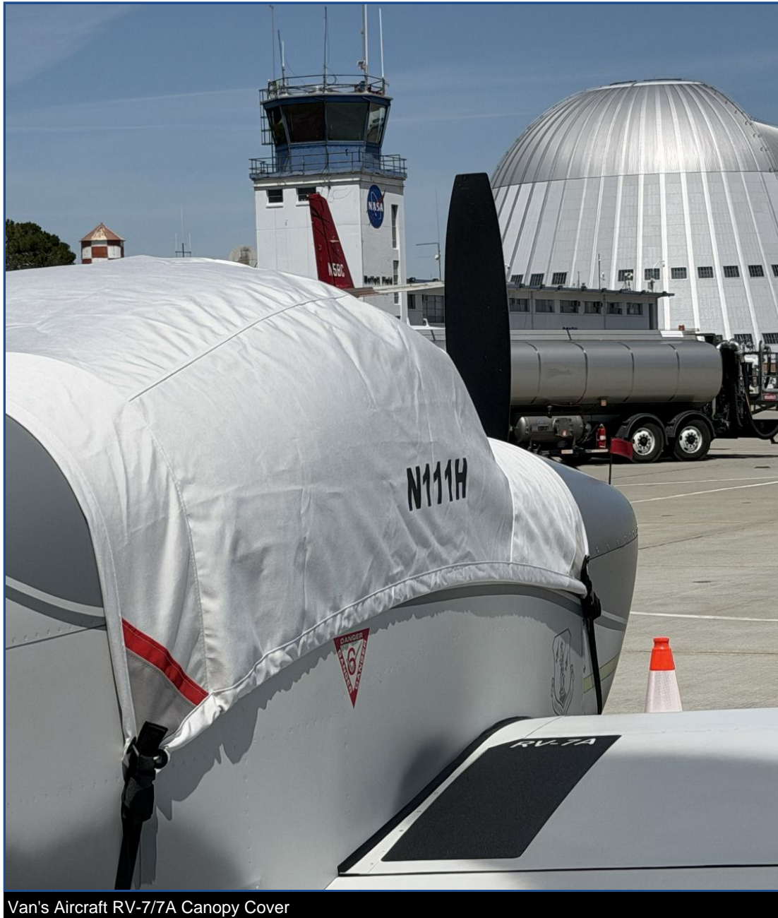
Van's Aircraft RV-7/7A Canopy Cover