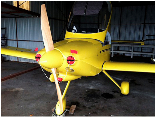
Van's RV-9A Engine Inlet Plugs