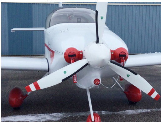
Van's RV-7 Engine Inlet Plugs, Sam James Cowling (Set of 3)