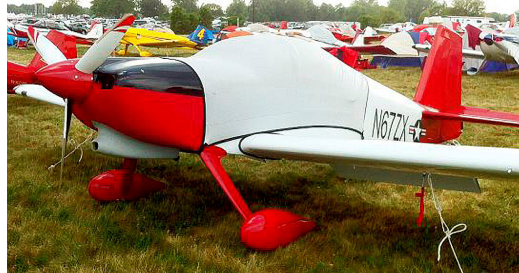
Light Weight Fitted Hangar Dust Cover

Travel Covers are made with Silver Solution-Dyed Polyester fabric and only lined over the windshield to save weight. The material is lightweight and more compact for easy stowage in the aircraft. The polyester material is water resistant, but only intended for occasional use outside. We also have an ultra lightweight material available for fitted hangar dust covers. For daily outdoor use, the non-travel Sunbrella Cover is the best choice.