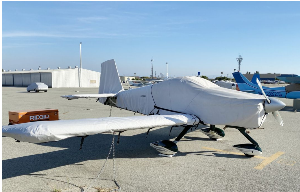
Van's RV-9A Extended Canopy/Engine, Wing & Empennage Covers

WINTER USE MATERIAL - Made with Solution-Dyed Polyester fabric, this option is intended for seasonal use to aid in deicing, rain mitigation, or for occasional travel. The material is lighter and more compact, but more susceptible to UV damage and may have a shorter useful life if used continuously outside than the all-year use material.