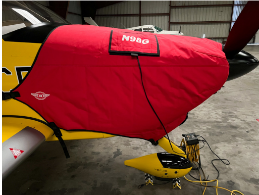
Van's RV-7/7A Insulated Engine Cover

This cover type is made from Silver Acrylic Sunbrella canvas and is 100% lined with a soft and smooth microfiber. Bruce's Custom Covers developed this material combination especially for aircraft protection. The outer material is medium weight and treated for water resistance, UV resistance and anti-static buildup. The inner lining is a very soft and smooth microfiber to prevent scratching. The material is very reflective, and tests show that the cabin interior temperature can be reduced to near-ambient temperature on the hottest of days. It is water, ice and snow repellent, yet breathable to allow moisture to escape from between the cover and the aircraft surface.