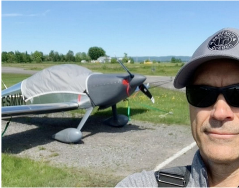
Van's RV-7 Travel Cover, Light Weight Canopy Cover

Travel Covers are made with Silver Solution-Dyed Polyester fabric and only lined over the windshield to save weight. The material is lightweight and more compact for easy stowage in the aircraft. The polyester material is water resistant, but only intended for occasional use outside. We also have an ultra lightweight material available for fitted hangar dust covers. For daily outdoor use, the non-travel Sunbrella Cover is the best choice.