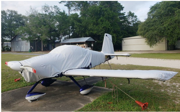
Van's RV-7A Cover Set

WINTER USE MATERIAL - Made with Solution-Dyed Polyester fabric, this option is intended for seasonal use to aid in deicing, rain mitigation, or for occasional travel. The material is lighter and more compact, but more susceptible to UV damage and may have a shorter useful life if used continuously outside than the all-year use material.