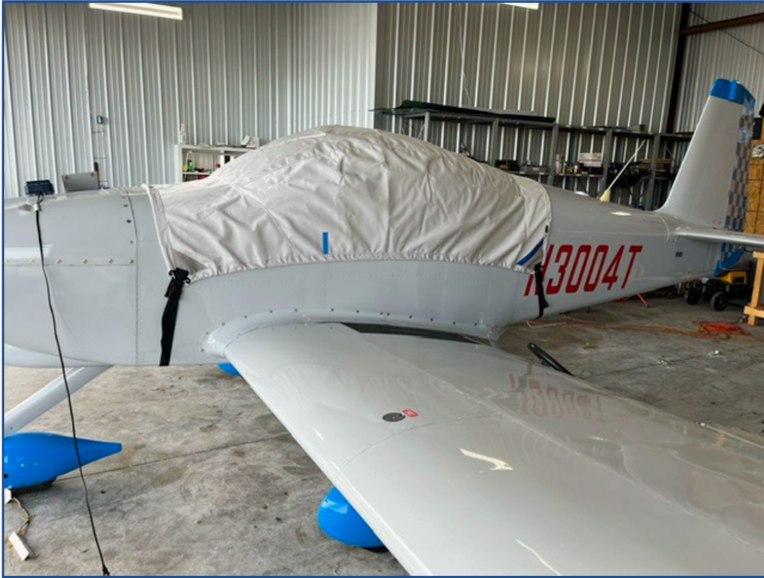
Van's RV-7 Canopy Cover