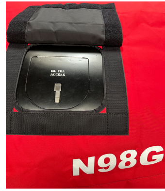
Van's Aircraft RV-7/7A Insulated Engine Cover