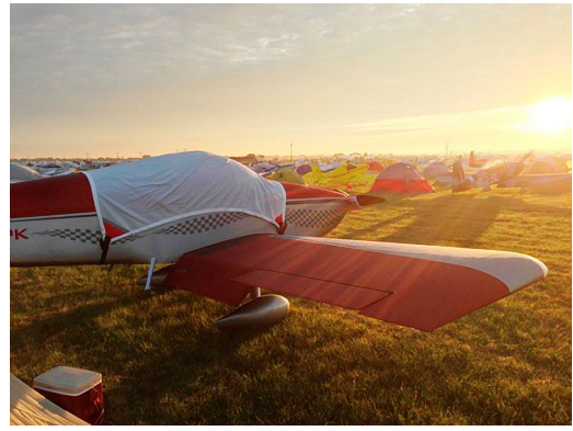
Van's RV-7 at Oshkosh, Canopy Cover