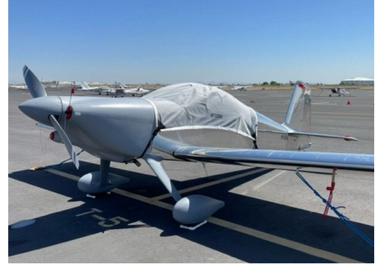
RV-7 Travel Cover, Travel Weight Canopy Cover