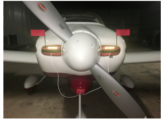
Van's Aircraft RV-7A Engine Inlet Plugs