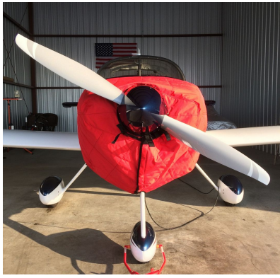
Van's RV-9A Insulated Engine Cover