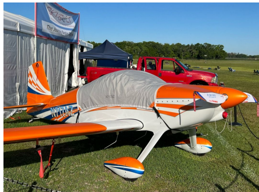
Van's RV-7 Travel Weight Canopy Cover