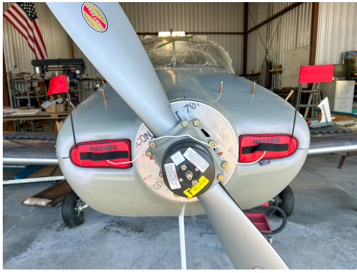
RV-7A Engine Inlet Plugs (set of 2)