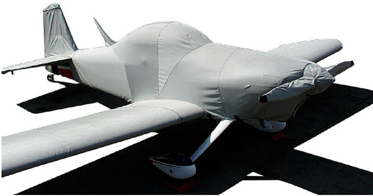
Van's RV-4 Complete Cover

This cover type is made from Silver Acrylic Sunbrella canvas and is 100% lined with a soft and smooth microfiber. Bruce's Custom Covers developed this material combination especially for aircraft protection. The outer material is medium weight and treated for water resistance, UV resistance and anti-static buildup. The inner lining is a very soft and smooth microfiber to prevent scratching. The material is very reflective, and tests show that the cabin interior temperature can be reduced to near-ambient temperature on the hottest of days. It is water, ice and snow repellent, yet breathable to allow moisture to escape from between the cover and the aircraft surface.