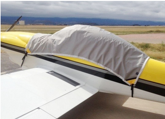
Van's Aircraft RV-4 Travel Cover, Light Weight Travel Canopy Cover, W/15" Fwd Extension, Belly Strap Type