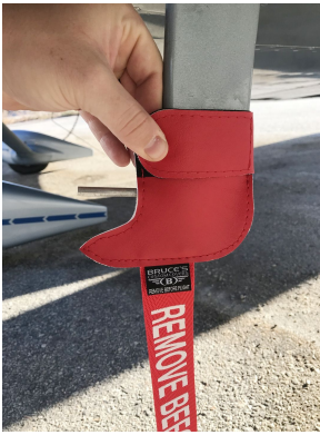
Van's RV-4 Custom Pitot Tube

Engine Inlet Plugs are custom fit for your Van's Aircraft RV-4 intakes, made with heavy-duty vinyl material, and stuffed with a single block of sculpted urethane foam. Each plug has a zipper that allows the foam to be removed and dried if necessary. Engine plugs have warning flags that are visible from the cockpit or 'remove before flight' streamers sewn onto the face of the plugs. Most plugs are imprinted with the aircraft registration number in black for an extra charge. Storage bag NOT included. Engine plugs may be inserted after flight when the engine is still warm. Engine Inlet Plugs are commonly referred to as Cowl Plugs, Intake Plugs, Cowl Blocks, Engine Blocks, and Engine Bungs.