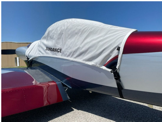
Vans RV-4 Canopy Cover