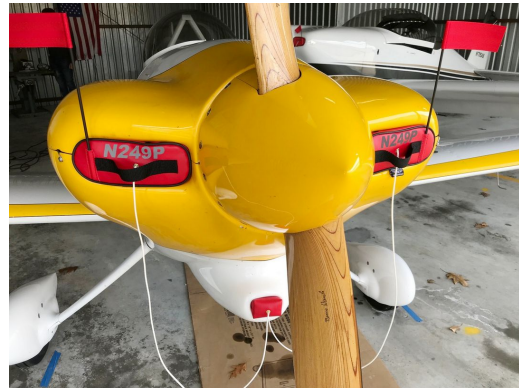
Van's RV-4 Engine Inlet Plugs