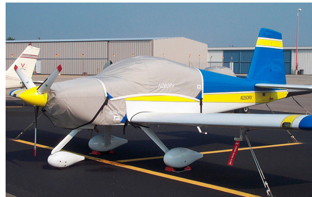
Van's RV-9 Canopy & Engine Covers