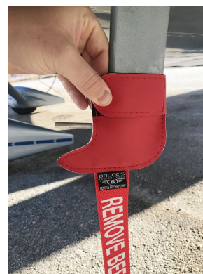
Van's RV-4 Custom Pitot Tube