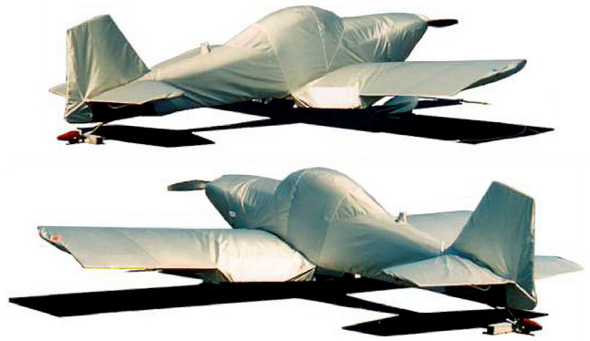
Vans's RV-4 Complete Cover