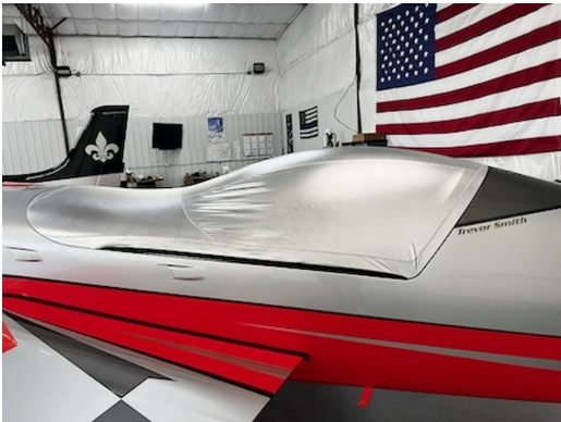
Extra NG Models Canopy Cover (SOLAR CAP EXAMPLE)

Travel Covers are made with Silver Solution-Dyed Polyester fabric and only lined over the windshield to save weight. The material is lightweight and more compact for easy stowage in the aircraft. The polyester material is water resistant, but only intended for occasional use outside. We also have an ultra lightweight material available for fitted hangar dust covers. For daily outdoor use, the non-travel Sunbrella Cover is the best choice.