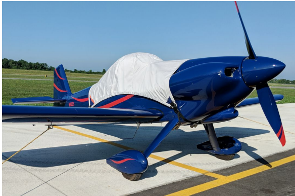
Van's RV-3 Canopy Cover

This cover type is made from Silver Acrylic Sunbrella canvas and is 100% lined with a soft and smooth microfiber. Bruce's Custom Covers developed this material combination especially for aircraft protection. The outer material is medium weight and treated for water resistance, UV resistance and anti-static buildup. The inner lining is a very soft and smooth microfiber to prevent scratching. The material is very reflective, and tests show that the cabin interior temperature can be reduced to near-ambient temperature on the hottest of days. It is water, ice and snow repellent, yet breathable to allow moisture to escape from between the cover and the aircraft surface.