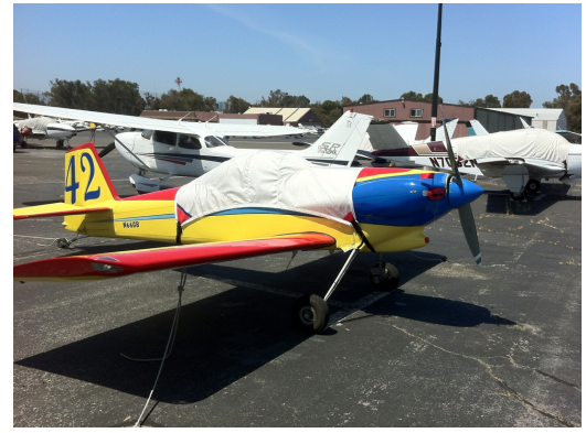
Vans's RV-3 Canopy Cover, Engine Plugs