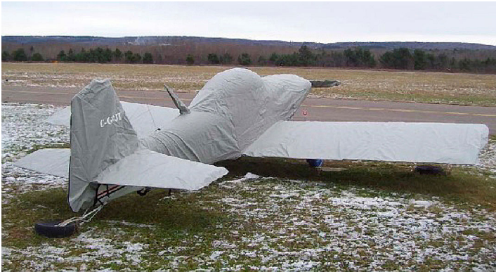
Van's RV-4 Complete Fuselage/Wing/Tail Surfaces cover

This cover type is made from Silver Acrylic Sunbrella canvas and is 100% lined with a soft and smooth microfiber. Bruce's Custom Covers developed this material combination especially for aircraft protection. The outer material is medium weight and treated for water resistance, UV resistance and anti-static buildup. The inner lining is a very soft and smooth microfiber to prevent scratching. The material is very reflective, and tests show that the cabin interior temperature can be reduced to near-ambient temperature on the hottest of days. It is water, ice and snow repellent, yet breathable to allow moisture to escape from between the cover and the aircraft surface.