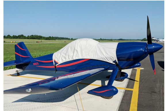
Van's RV-3 Canopy Cover