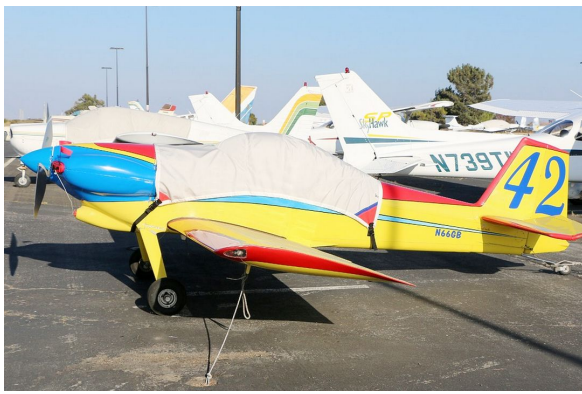
Van's RV-3 Canopy Cover and Engine Plugs