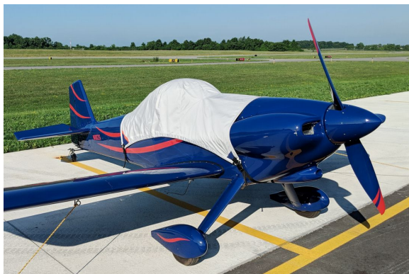
Van's RV-3 Canopy Cover

This cover type is made from Silver Acrylic Sunbrella canvas and is 100% lined with a soft and smooth microfiber. Bruce's Custom Covers developed this material combination especially for aircraft protection. The outer material is medium weight and treated for water resistance, UV resistance and anti-static buildup. The inner lining is a very soft and smooth microfiber to prevent scratching. The material is very reflective, and tests show that the cabin interior temperature can be reduced to near-ambient temperature on the hottest of days. It is water, ice and snow repellent, yet breathable to allow moisture to escape from between the cover and the aircraft surface.