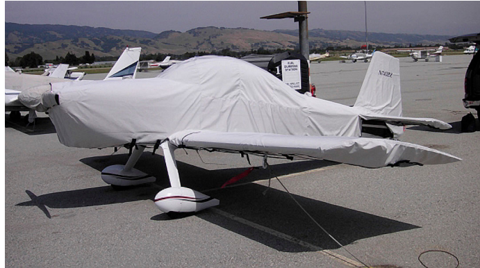
Van's RV-7 Insulated Engine Cover, 3D model Van's RV-8 Complete Fuselage Cover w/ Detachable Wing Covers & Prop Cover