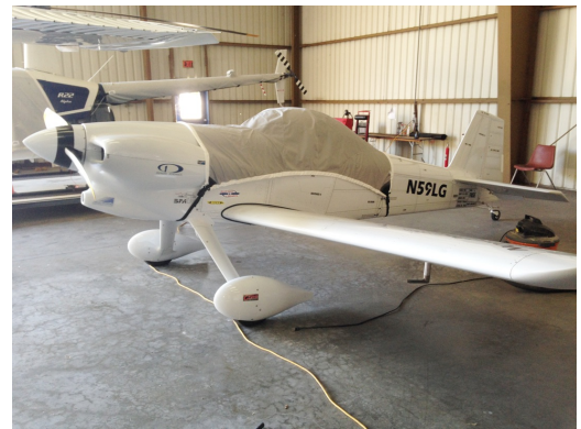
Van's RV-3 Light Weight Travel Cover