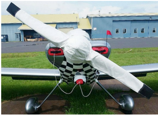
Van's RV-3 Engine Plugs, Prop/Spinner Cover