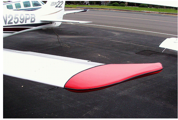
Cirrus SR-22 Wingtip Pad (also available for the Horiz. Stab.)