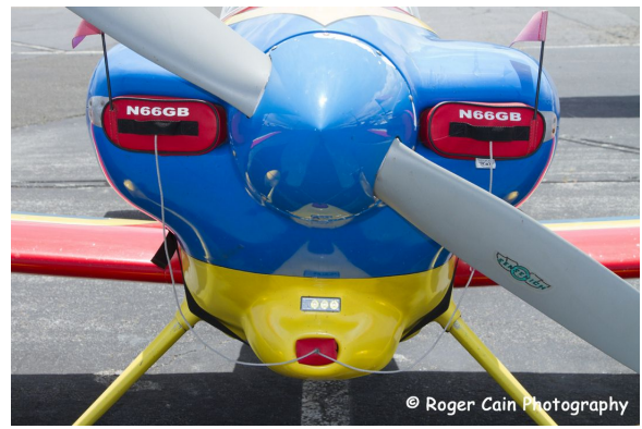
Van's RV-3 Engine Plugs