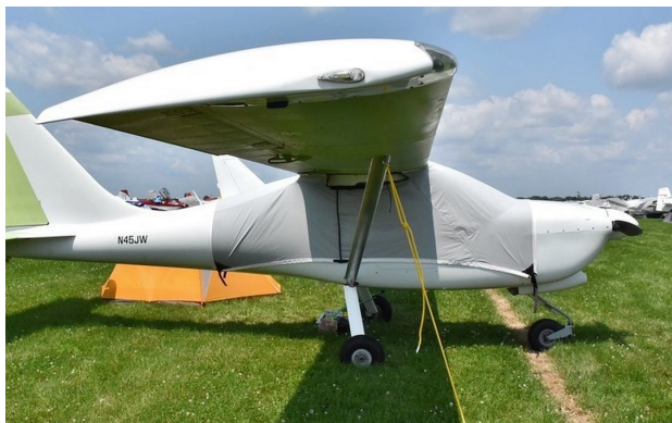
Glastar Travel Cover

Travel Covers are made with Silver Solution-Dyed Polyester fabric and only lined over the windshield to save weight. The material is lightweight and more compact for easy stowage in the aircraft. The polyester material is water resistant, but only intended for occasional use outside. We also have an ultra lightweight material available for fitted hangar dust covers. For daily outdoor use, the non-travel Sunbrella Cover is the best choice.