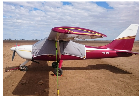
Glastar Sportsman Light Weight Travel Cover