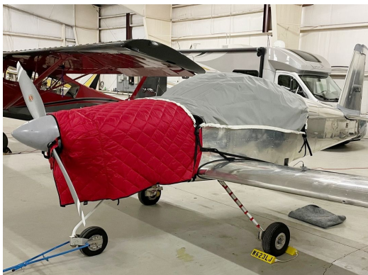
Van's RV-7 Travel Canopy Cover, Hangar Blanket

This cover type is made from Silver Acrylic Sunbrella canvas and is 100% lined with a soft and smooth microfiber. Bruce's Custom Covers developed this material combination especially for aircraft protection. The outer material is medium weight and treated for water resistance, UV resistance and anti-static buildup. The inner lining is a very soft and smooth microfiber to prevent scratching. The material is very reflective, and tests show that the cabin interior temperature can be reduced to near-ambient temperature on the hottest of days. It is water, ice and snow repellent, yet breathable to allow moisture to escape from between the cover and the aircraft surface.