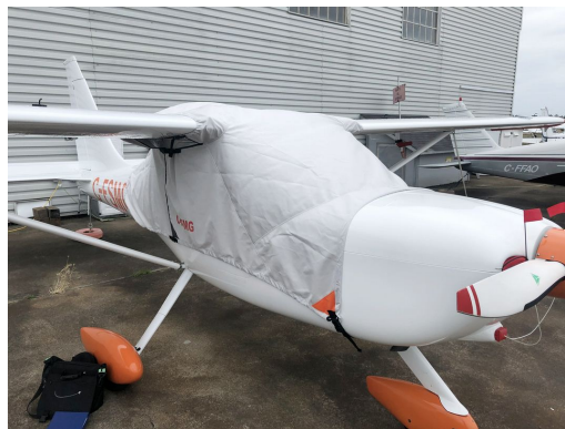
Glastar Canopy Cover, Engine Plugs