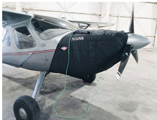
Glasair Aviation Glastar, Sportsman 2+2 Insulated Engine Cover