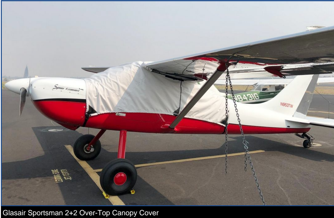
Glasair Sportsman 2+2 Over-Top Canopy Cover