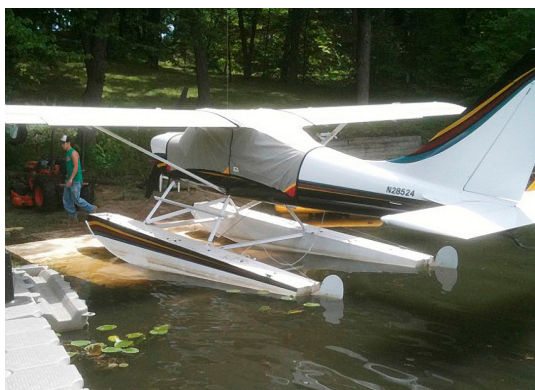
Glstar Sportsman Canopy Cover

This cover type is made from Silver Acrylic Sunbrella canvas and is 100% lined with a soft and smooth microfiber. Bruce's Custom Covers developed this material combination especially for aircraft protection. The outer material is medium weight and treated for water resistance, UV resistance and anti-static buildup. The inner lining is a very soft and smooth microfiber to prevent scratching. The material is very reflective, and tests show that the cabin interior temperature can be reduced to near-ambient temperature on the hottest of days. It is water, ice and snow repellent, yet breathable to allow moisture to escape from between the cover and the aircraft surface.