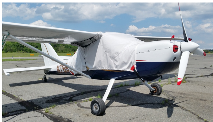
Glstar Over-Top Canopy Cover, Engine Plugs