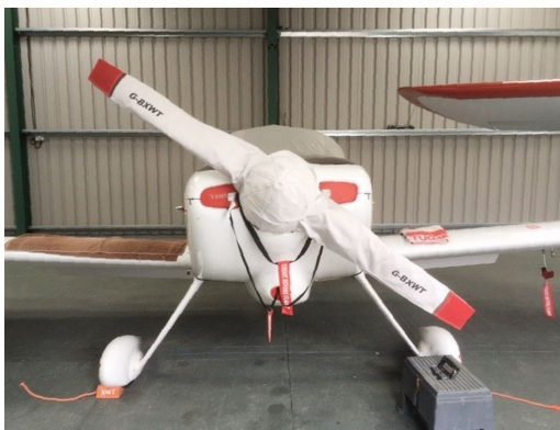
Van's RV-6 Prop/Spinner Cover

This cover type is made from Silver Acrylic Sunbrella canvas and is 100% lined with a soft and smooth microfiber. Bruce's Custom Covers developed this material combination especially for aircraft protection. The outer material is medium weight and treated for water resistance, UV resistance and anti-static buildup. The inner lining is a very soft and smooth microfiber to prevent scratching. The material is very reflective, and tests show that the cabin interior temperature can be reduced to near-ambient temperature on the hottest of days. It is water, ice and snow repellent, yet breathable to allow moisture to escape from between the cover and the aircraft surface.