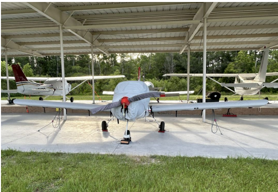
Van's RV-12 Canopy/Engine & Wing Covers