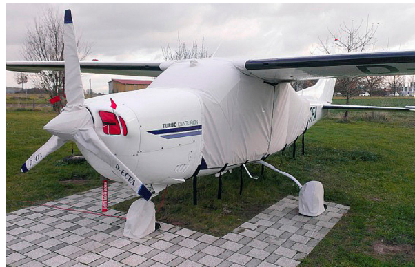
Cessna 210 Extended Canopy Cover, Engine Plugs, Prop and Tire Covers