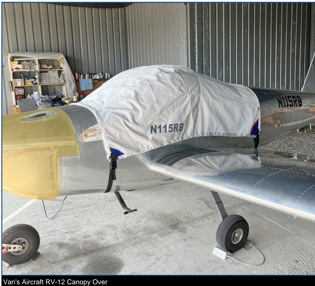
Van's Aircraft RV-12 Canopy Over