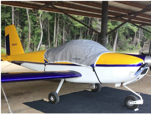
Van's RV-12IS Light Weight Travel Cover

Travel Covers are made with Silver Solution-Dyed Polyester fabric and only lined over the windshield to save weight. The material is lightweight and more compact for easy stowage in the aircraft. The polyester material is water resistant, but only intended for occasional use outside. We also have an ultra lightweight material available for fitted hangar dust covers. For daily outdoor use, the non-travel Sunbrella Cover is the best choice.