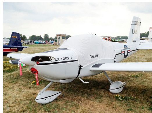
Vans's RV-12 Canopy Cover & Engine Plugs