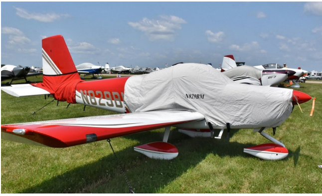
Van's RV-12 Extended Canopy/Engine & Tailcone Covers