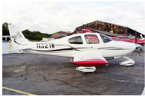
Cirrus SR-20/22 Wingtip Pads