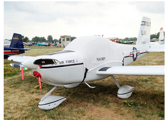
ENGINE PLUGS PREVENT BIRD NEST FOD. Piper Saratoga Engine Cowling Bird's Vans's RV-12 Canopy Cover & Engine Plugs Nest