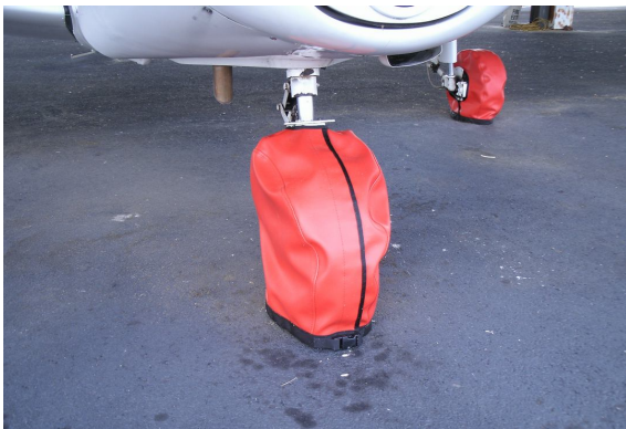
Piper PA28-140 Tire Covers

ALL-YEAR USE MATERIAL - Made with Silver Acrylic Sunbrella canvas, the all-year use material is the best option for sun protection and cover longevity. This heavier more durable material is intended for all weather conditions, such as rain and snow or lots of sun.