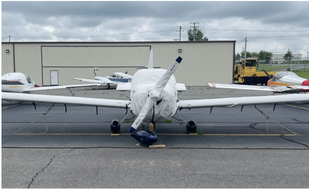
Vans RV-12 Complete Cover Set

WINTER USE MATERIAL - Made with Solution-Dyed Polyester fabric, this option is intended for seasonal use to aid in deicing, rain mitigation, or for occasional travel. The material is lighter and more compact, but more susceptible to UV damage and may have a shorter useful life if used continuously outside than the all-year use material.