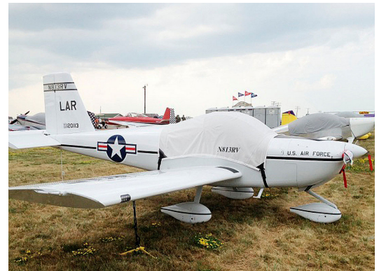
Vans's RV-12 Canopy Cover & Engine Plugs