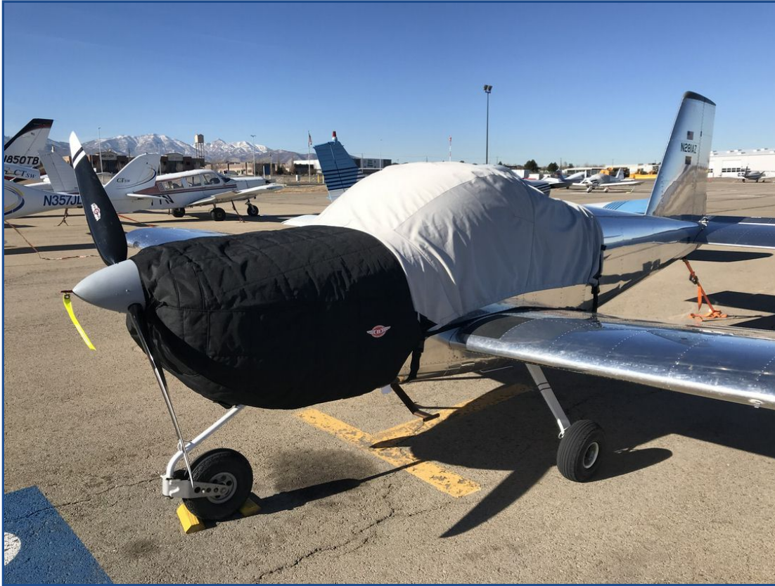
Van's RV-12 Canopy Cover, Insulated Engine Cover