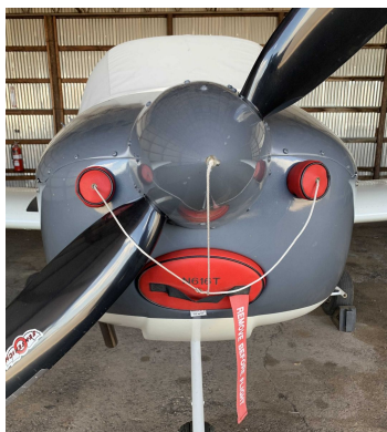
Vans RV-12 Engine Plugs

Engine Inlet Plugs are custom fit for your Van's Aircraft RV-12 & RV-12is intakes, made with heavy-duty vinyl material, and stuffed with a single block of sculpted urethane foam. Each plug has a zipper that allows the foam to be removed and dried if necessary. Engine plugs have warning flags that are visible from the cockpit or 'remove before flight' streamers sewn onto the face of the plugs. Most plugs are imprinted with the aircraft registration number in black for an extra charge. Storage bag NOT included. Engine plugs may be inserted after flight when the engine is still warm. Engine Inlet Plugs are commonly referred to as Cowl Plugs, Intake Plugs, Cowl Blocks, Engine Blocks, and Engine Bunges.