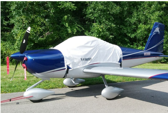
Van's Aircraft RV-12 Canopy Cover

This cover type is made from Silver Acrylic Sunbrella canvas and is 100% lined with a soft and smooth microfiber. Bruce's Custom Covers developed this material combination especially for aircraft protection. The outer material is medium weight and treated for water resistance, UV resistance and anti-static buildup. The inner lining is a very soft and smooth microfiber to prevent scratching. The material is very reflective, and tests show that the cabin interior temperature can be reduced to near-ambient temperature on the hottest of days. It is water, ice and snow repellent, yet breathable to allow moisture to escape from between the cover and the aircraft surface.