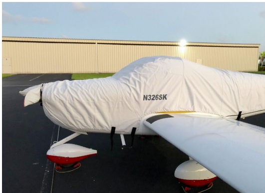
Van's RV-12 Extended Canopy/Engine Cover (special: extends to tail)

This cover type is made from Silver Acrylic Sunbrella canvas and is 100% lined with a soft and smooth microfiber. Bruce's Custom Covers developed this material combination especially for aircraft protection. The outer material is medium weight and treated for water resistance, UV resistance and anti-static buildup. The inner lining is a very soft and smooth microfiber to prevent scratching. The material is very reflective, and tests show that the cabin interior temperature can be reduced to near-ambient temperature on the hottest of days. It is water, ice and snow repellent, yet breathable to allow moisture to escape from between the cover and the aircraft surface.