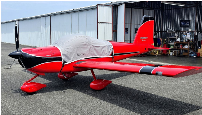
Van's RV-12IS Travel Cover, Light Weight Canopy Cover

Travel Covers are made with Silver Solution-Dyed Polyester fabric and only lined over the windshield to save weight. The material is lightweight and more compact for easy stowage in the aircraft. The polyester material is water resistant, but only intended for occasional use outside. We also have an ultra lightweight material available for fitted hangar dust covers. For daily outdoor use, the non-travel Sunbrella Cover is the best choice.