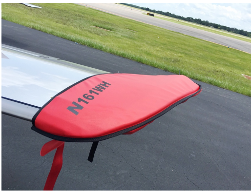
Cirrus SR-20/22 Wingtip Pads