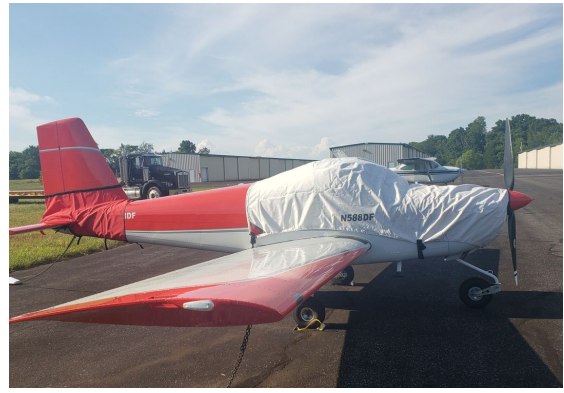
Van's RV-12 Canopy/Engine Cover, Tailcone Cover (raincap type)