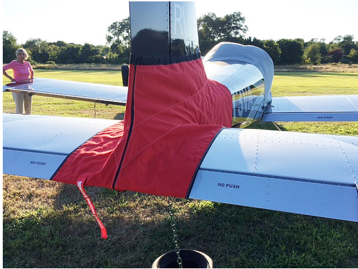
Van's RV-12 Tailcone Cover, raincap type