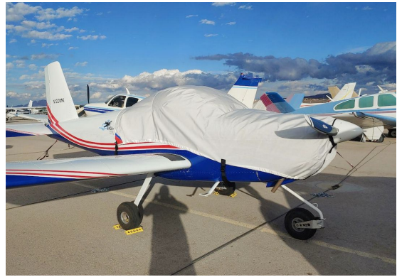
Vans RV-12 Canopy/Engine Cover