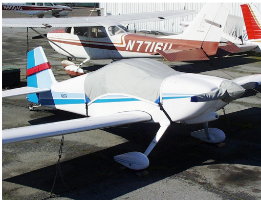
Vans's RV-6 Canopy Cover, Prop Cover

This cover type is made from Silver Acrylic Sunbrella canvas and is 100% lined with a soft and smooth microfiber. Bruce's Custom Covers developed this material combination especially for aircraft protection. The outer material is medium weight and treated for water resistance, UV resistance and anti-static buildup. The inner lining is a very soft and smooth microfiber to prevent scratching. The material is very reflective, and tests show that the cabin interior temperature can be reduced to near-ambient temperature on the hottest of days. It is water, ice and snow repellent, yet breathable to allow moisture to escape from between the cover and the aircraft surface.