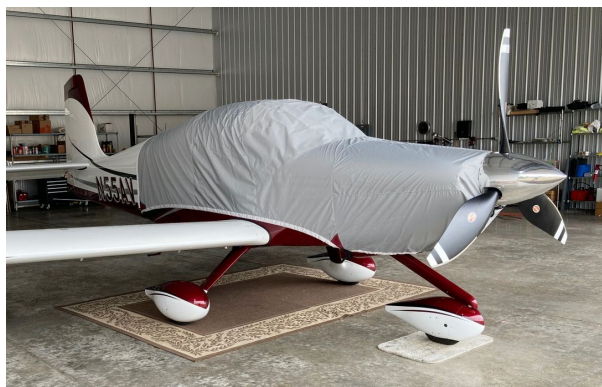
Van's RV-10 Travel Cover

Travel Covers are made with Silver Solution-Dyed Polyester fabric and only lined over the windshield to save weight. The material is lightweight and more compact for easy stowage in the aircraft. The polyester material is water resistant, but only intended for occasional use outside. We also have an ultra lightweight material available for fitted hangar dust covers. For daily outdoor use, the non-travel Sunbrella Cover is the best choice.