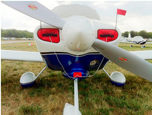
Van's RV-10 Canopy Cover & Engine Inlet Plugs

Engine Inlet Plugs are custom fit for your Van's Aircraft RV-10 intakes, made with heavy-duty vinyl material, and stuffed with a single block of sculpted urethane foam. Each plug has a zipper that allows the foam to be removed and dried if necessary. Engine plugs have warning flags that are visible from the cockpit or 'remove before flight' streamers sewn onto the face of the plugs. Most plugs are imprinted with the aircraft registration number in black for an extra charge. Storage bag NOT included. Engine plugs may be inserted after flight when the engine is still warm. Engine Inlet Plugs are commonly referred to as Cowl Plugs, Intake Plugs, Cowl Blocks, Engine Blocks, and Engine Bungs.