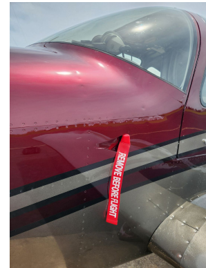
RV-10 Air Vent Wedge Plugs