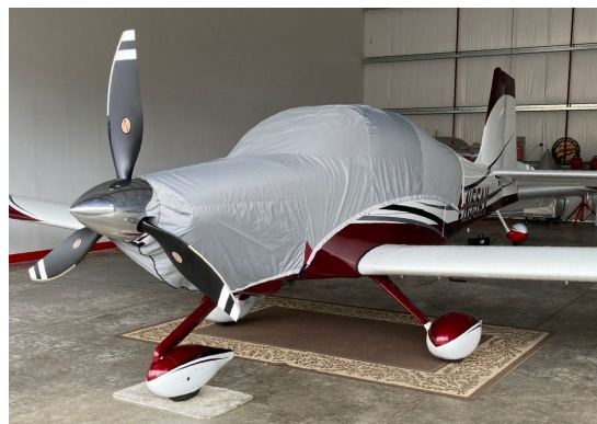
Van's RV-10 Travel Cover