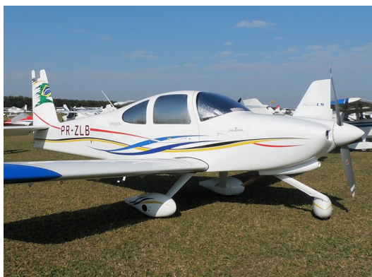
Van's RV-10 HeatShield Set