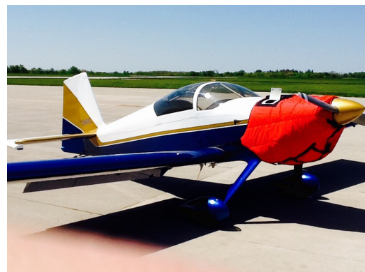
Van's RV-7 Insulated Engine Cover