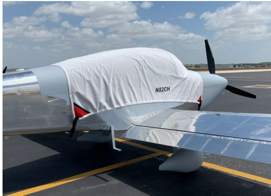
RV-10 Canopy Cover

This cover type is made from Silver Acrylic Sunbrella canvas and is 100% lined with a soft and smooth microfiber. Bruce's Custom Covers developed this material combination especially for aircraft protection. The outer material is medium weight and treated for water resistance, UV resistance and anti-static buildup. The inner lining is a very soft and smooth microfiber to prevent scratching. The material is very reflective, and tests show that the cabin interior temperature can be reduced to near-ambient temperature on the hottest of days. It is water, ice and snow repellent, yet breathable to allow moisture to escape from between the cover and the aircraft surface.