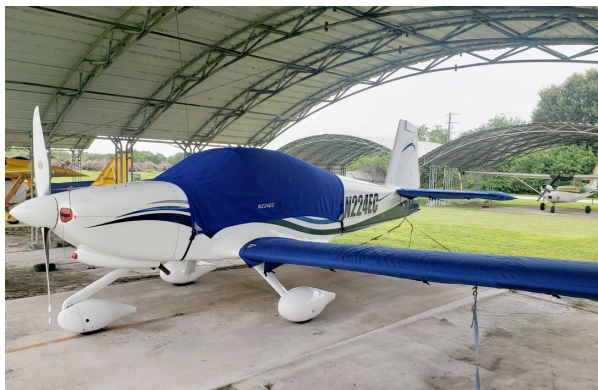
Vans's RV-10 Wing Covers