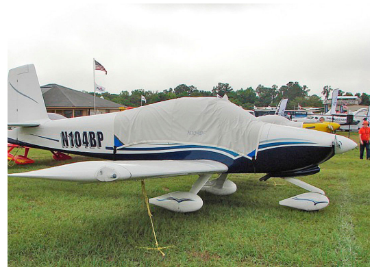
Van's RV-10 Canopy Cover