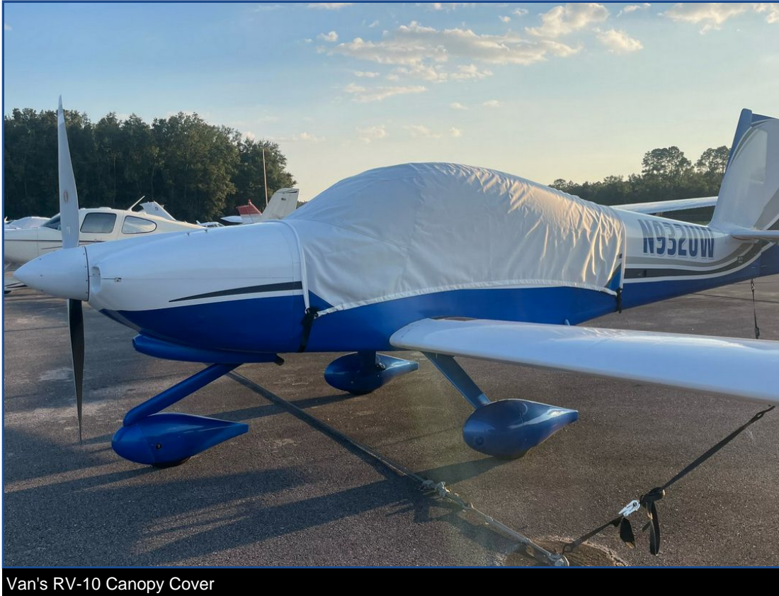
Van's RV-10 Canopy Cover