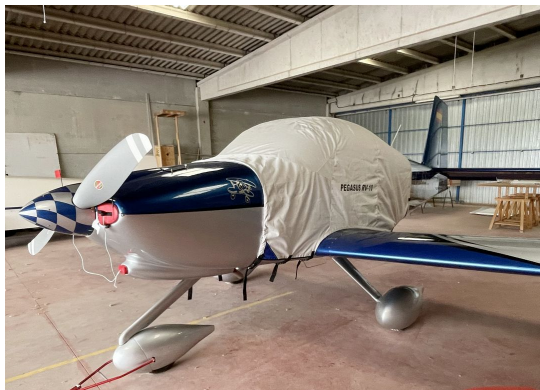
Van's RV-10 Extended Canopy Cover, Engine Plugs

This cover type is made from Silver Acrylic Sunbrella canvas and is 100% lined with a soft and smooth microfiber. Bruce's Custom Covers developed this material combination especially for aircraft protection. The outer material is medium weight and treated for water resistance, UV resistance and anti-static buildup. The inner lining is a very soft and smooth microfiber to prevent scratching. The material is very reflective, and tests show that the cabin interior temperature can be reduced to near-ambient temperature on the hottest of days. It is water, ice and snow repellent, yet breathable to allow moisture to escape from between the cover and the aircraft surface.