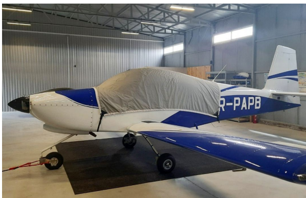
Van's RV-10 Travel Weight Canopy Cover

Travel Covers are made with Silver Solution-Dyed Polyester fabric and only lined over the windshield to save weight. The material is lightweight and more compact for easy stowage in the aircraft. The polyester material is water resistant, but only intended for occasional use outside. We also have an ultra lightweight material available for fitted hangar dust covers. For daily outdoor use, the non-travel Sunbrella Cover is the best choice.