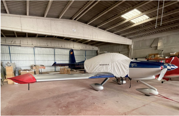
Van's RV-10 Extended Canopy Cover, Wingtip Pads

Designed to prevent damage to the aircraft extremities in crowded hangars, these products are made of bright red Naugahyde and thickly padded with a sandwich of closed cell foam.