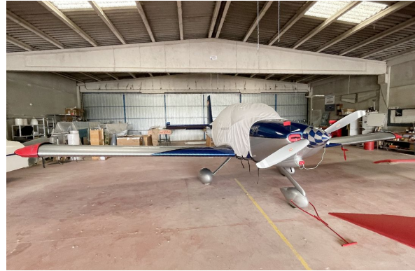
Van's RV-10 Extended Canopy Cover, Wingtip Pads, Engine Plugs