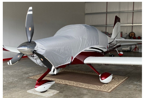
Van's RV-10 Travel Cover