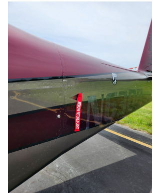
RV-10 Air Vent Wedge Plugs