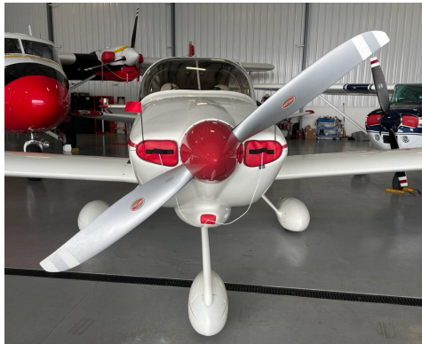
Van's RV-10 Engine Inlet Plugs

Engine Inlet Plugs are custom fit for your Van's Aircraft RV-10 intakes, made with heavy-duty vinyl material, and stuffed with a single block of sculpted urethane foam. Each plug has a zipper that allows the foam to be removed and dried if necessary. Engine plugs have warning flags that are visible from the cockpit or 'remove before flight' streamers sewn onto the face of the plugs. Most plugs are imprinted with the aircraft registration number in black for an extra charge. Storage bag NOT included. Engine plugs may be inserted after flight when the engine is still warm. Engine Inlet Plugs are commonly referred to as Cowl Plugs, Intake Plugs, Cowl Blocks, Engine Blocks, and Engine Bungs.