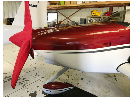
Van's RV-9 Insulated Prop Cover, 3-blade