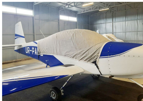
Van's RV-10 Travel Weight Canopy Cover