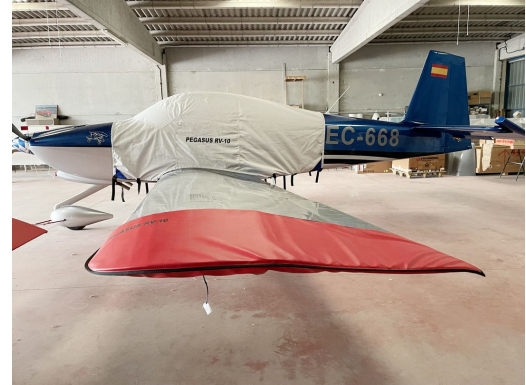
Van's RV-10 Extended Canopy Cover, Wingtip Pads