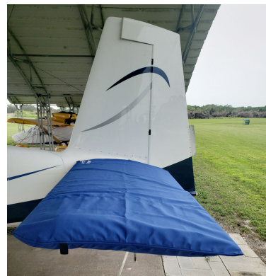
Van's RV-10 Horizontal Stabilizer Covers