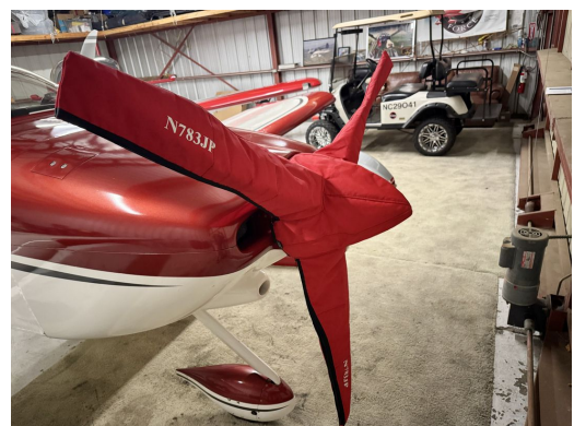
Van's RV-9 Insulated Prop Cover, 3-Blade