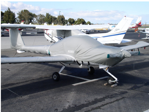
DA-20 Full Cover Set

This cover type is made from Silver Acrylic Sunbrella canvas and is 100% lined with a soft and smooth microfiber. Bruce's Custom Covers developed this material combination especially for aircraft protection. The outer material is medium weight and treated for water resistance, UV resistance and anti-static buildup. The inner lining is a very soft and smooth microfiber to prevent scratching. The material is very reflective, and tests show that the cabin interior temperature can be reduced to near-ambient temperature on the hottest of days. It is water, ice and snow repellent, yet breathable to allow moisture to escape from between the cover and the aircraft surface.