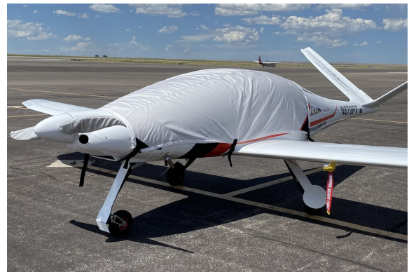
Swiss Excellence Risen 914 Canopy Cover