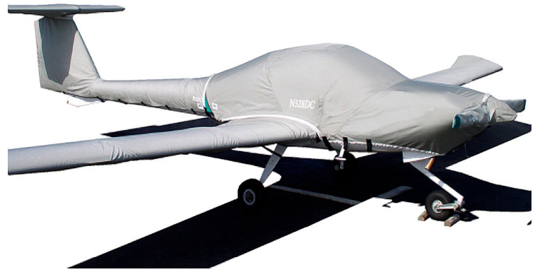
DA-20 Full Cover Set