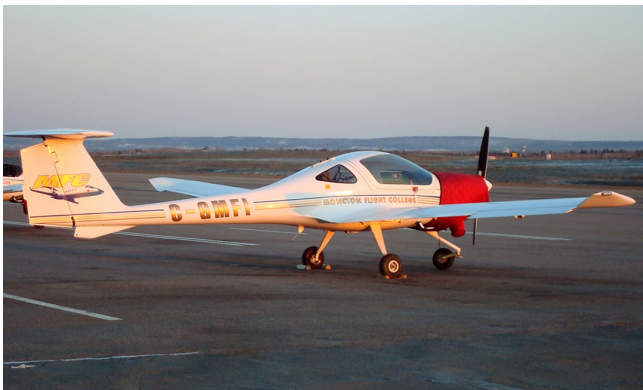
Diamond DA-20 Insulated Engine Cover

This cover type is made from Silver Acrylic Sunbrella canvas and is 100% lined with a soft and smooth microfiber. Bruce's Custom Covers developed this material combination especially for aircraft protection. The outer material is medium weight and treated for water resistance, UV resistance and anti-static buildup. The inner lining is a very soft and smooth microfiber to prevent scratching. The material is very reflective, and tests show that the cabin interior temperature can be reduced to near-ambient temperature on the hottest of days. It is water, ice and snow repellent, yet breathable to allow moisture to escape from between the cover and the aircraft surface.