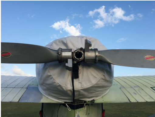
Republic Seabee Engine Cover