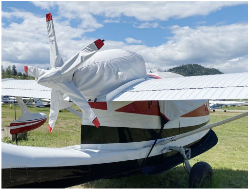
Republic Seabee Canopy, Engine, Prop Cover (5-blade)

The material is very reflective, and tests show that the cabin interior temperature can be reduced to near-ambient temperature on the hottest of days. It is water, ice and snow repellent, yet breathable to allow moisture to escape from between the cover and the aircraft surface.