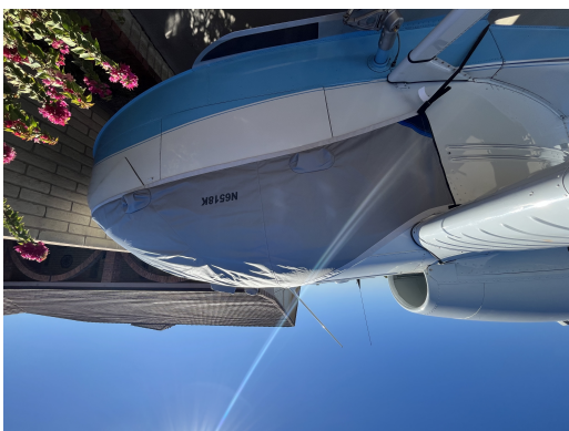
Seabee Amphibian Travel Cover, Light Weight Canopy Cover

This cover type is made from Silver Acrylic Sunbrella canvas and is 100% lined with a soft and smooth microfiber. Bruce's Custom Covers developed this material combination especially for aircraft protection. The outer material is medium weight and treated for water resistance, UV resistance and anti-static buildup. The inner lining is a very soft and smooth microfiber to prevent scratching. The material is very reflective, and tests show that the cabin interior temperature can be reduced to near-ambient temperature on the hottest of days. It is water, ice and snow repellent, yet breathable to allow moisture to escape from between the cover and the aircraft surface.