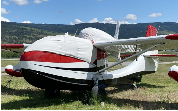
Republic Seabee Canopy, Engine, Prop Cover (5-blade)

The material is very reflective, and tests show that the cabin interior temperature can be reduced to near-ambient temperature on the hottest of days. It is water, ice and snow repellent, yet breathable to allow moisture to escape from between the cover and the aircraft surface.