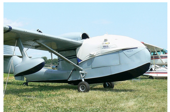
Republic Seabee Canopy Cover