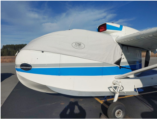
Republic Seabee Canopy Cover