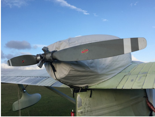
Republic Seabee Engine Cover

water resistance, UV resistance and anti-static buildup. The inner lining is a very soft and smooth microfiber to prevent scratching. The material is very reflective, and tests show that the cabin interior temperature can be reduced to near-ambient temperature on the hottest of days. It is water, ice and snow repellent, yet breathable to allow moisture to escape from between the cover and the aircraft surface.