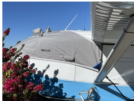
Seabee Amphibian Travel Cover, Light Weight Canopy Cover