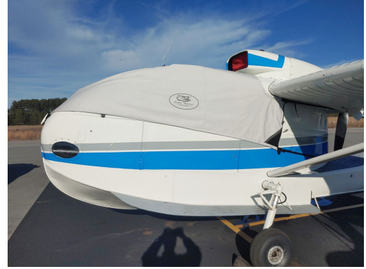
Republic Seabee Canopy Cover