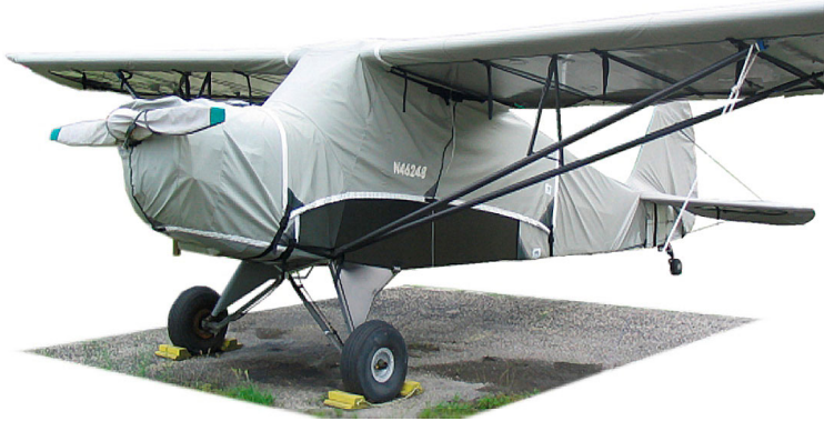
Prop Cover, Engine Cover, Canopy Cover, Wing Covers and Empennage Cover