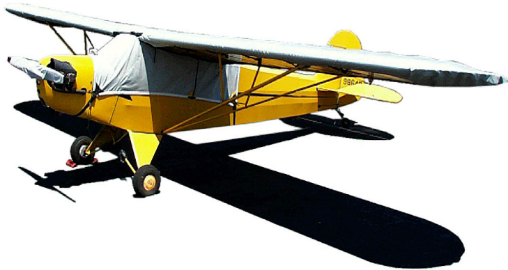
Piper J3 Canopy, Wing and Prop Covers

This cover type is made from Silver Acrylic Sunbrella canvas and is 100% lined with a soft and smooth microfiber. Bruce's Custom Covers developed this material combination especially for aircraft protection. The outer material is medium weight and treated for water resistance, UV resistance and anti-static buildup. The inner lining is a very soft and smooth microfiber to prevent scratching. The material is very reflective, and tests show that the cabin interior temperature can be reduced to near-ambient temperature on the hottest of days. It is water, ice and snow repellent, yet breathable to allow moisture to escape from between the cover and the aircraft surface.