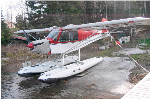
FOR INTERIOR USE. Cub Crafters CC-11 Insulated Hangar Blanket, Rans S-7 Insulated Engine, Wing and Horizontal Stabilizer Covers available in Red or Silver