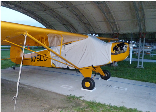
Piper J-3 Extended Canopy Cover