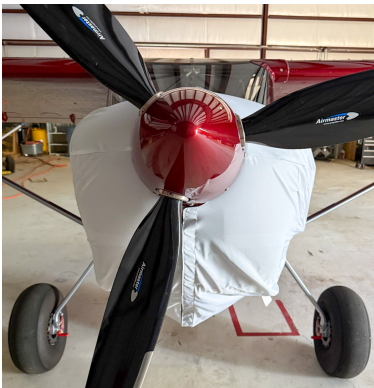
Rans S-21 Engine Cover, test fit cover

the hottest of days. It is water, ice and snow repellent, yet breathable to allow moisture to escape from between the cover and the aircraft surface.