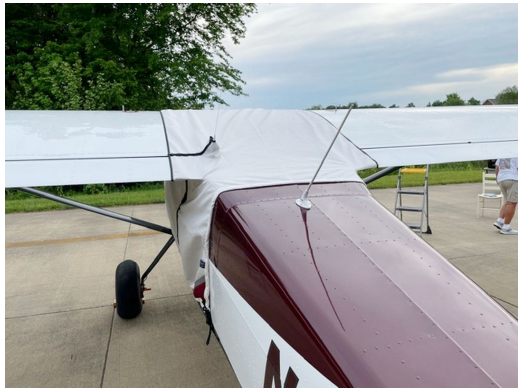
Rans S-21 Outbound Canopy Cover