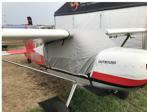
Rans S-21 Travel Canopy Cover

Travel Covers are made with Silver Solution-Dyed Polyester fabric and only lined over the windshield to save weight. The material is lightweight and more compact for easy stowage in the aircraft. The polyester material is water resistant, but only intended for occasional use outside. We also have an ultra lightweight material available for fitted hangar dust covers. For daily outdoor use, the non-travel Sunbrella Cover is the best choice.