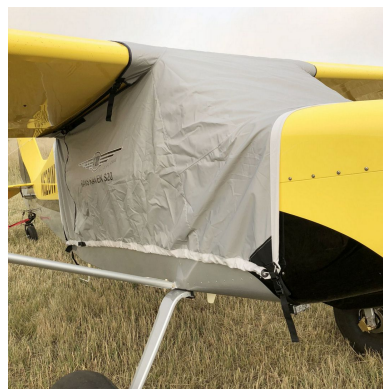
Rans S-20 Raven Travel Cover, Light Weight Travel Canopy Cover