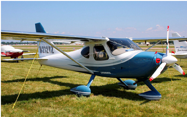
Glaster Sportsman Engine Inlet Plugs