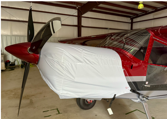
Rans S-21 Engine Cover, test fit cover