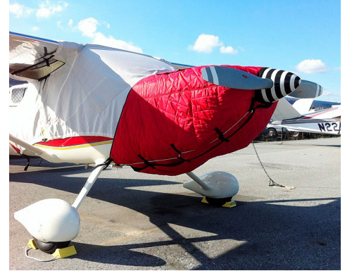
Glastar Insulated Engine Cover