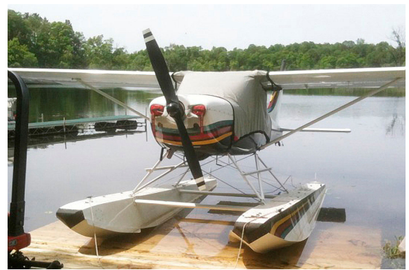
Glastar Sportsman Canopy Cover and Engine Plugs