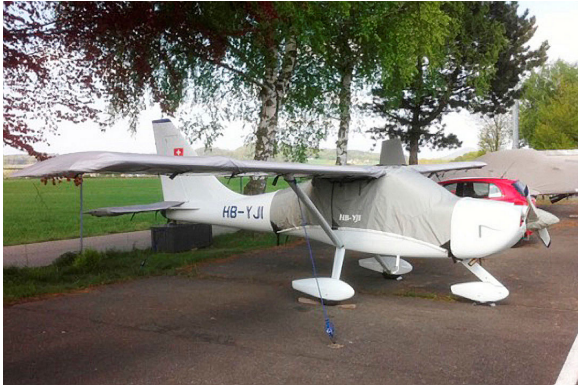
OMF Symphony Canopy, Wings, Horiz. Stab, and Prop Covers

This cover type is made from Silver Acrylic Sunbrella canvas and is 100% lined with a soft and smooth microfiber. Bruce's Custom Covers developed this material combination especially for aircraft protection. The outer material is medium weight and treated for water resistance, UV resistance and anti-static buildup. The inner lining is a very soft and smooth microfiber to prevent scratching. The material is very reflective, and tests show that the cabin interior temperature can be reduced to near-ambient temperature on the hottest of days. It is water, ice and snow repellent, yet breathable to allow moisture to escape from between the cover and the aircraft surface.