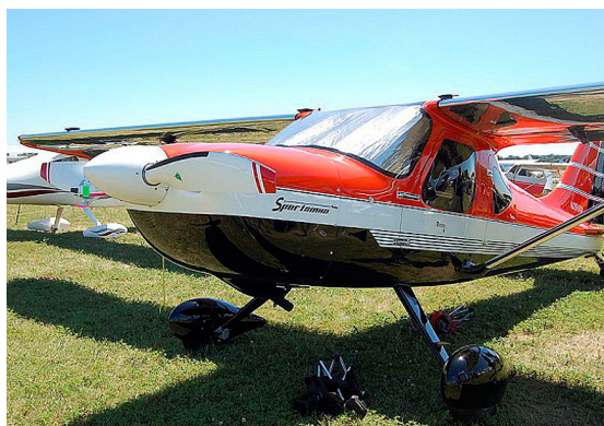
Glastar Sportsman Windshield HeatShield