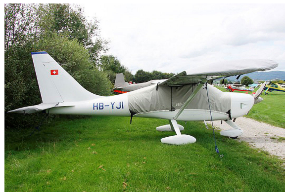
Glastar Canopy, Wings, Horizontal Stab. & Prop Covers