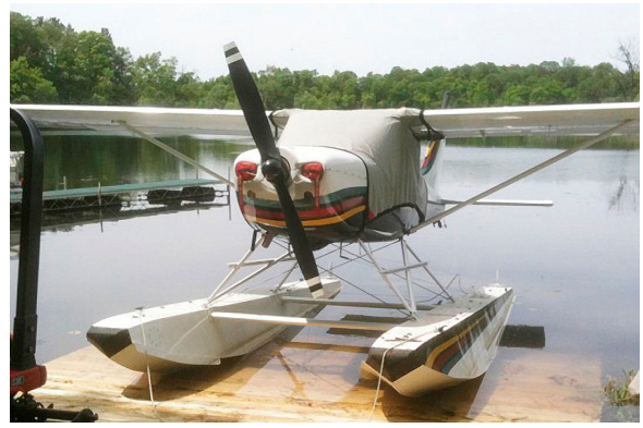
Glstar Sportsman Canopy Cover and Engine Plugs