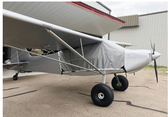
RANS S20 TRAVEL COVER