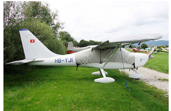
Glastar Canopy, Wings, Horizontal Stab. & Prop Covers