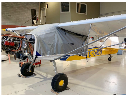
Rans RS20 Travel Weight Canopy Cover

Travel Covers are made with Silver Solution-Dyed Polyester fabric and only lined over the windshield to save weight. The material is lightweight and more compact for easy stowage in the aircraft. The polyester material is water resistant, but only intended for occasional use outside. We also have an ultra lightweight material available for fitted hangar dust covers. For daily outdoor use, the non-travel Sunbrella Cover is the best choice.