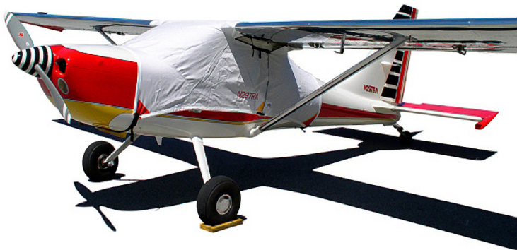
Glastar Over-Top Canopy Cover