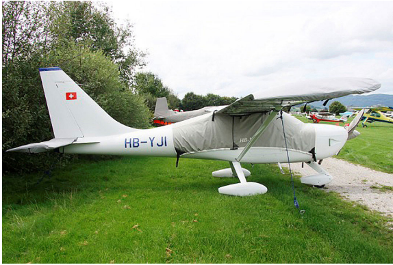
Glastar Canopy, Wings, Horizontal Stab. & Prop Covers

This cover type is made from Silver Acrylic Sunbrella canvas and is 100% lined with a soft and smooth microfiber. Bruce's Custom Covers developed this material combination especially for aircraft protection. The outer material is medium weight and treated for water resistance, UV resistance and anti-static buildup. The inner lining is a very soft and smooth microfiber to prevent scratching. The material is very reflective, and tests show that the cabin interior temperature can be reduced to near-ambient temperature on the hottest of days. It is water, ice and snow repellent, yet breathable to allow moisture to escape from between the cover and the aircraft surface.