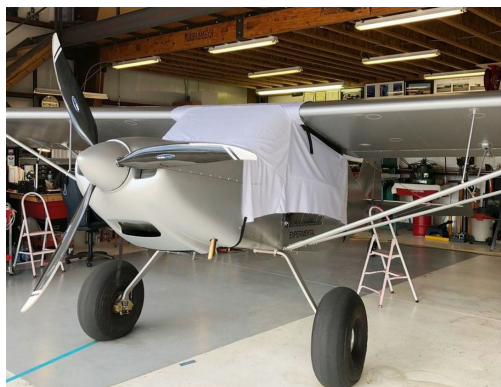
Rans S-20 Canopy Cover, test fit cover

Travel Covers are made with Silver Solution-Dyed Polyester fabric and only lined over the windshield to save weight. The material is lightweight and more compact for easy stowage in the aircraft. The polyester material is water resistant, but only intended for occasional use outside. We also have an ultra lightweight material available for fitted hangar dust covers. For daily outdoor use, the non-travel Sunbrella Cover is the best choice.