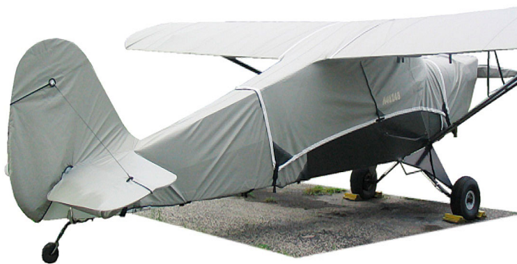
Taylorcraft L-2 Grasshopper Prop, Engine, Canopy, Wing and Empennage Covers

WINTER USE MATERIAL - Made with Solution-Dyed Polyester fabric, this option is intended for seasonal use to aid in deicing, rain mitigation, or for occasional travel. The material is lighter and more compact, but more susceptible to UV damage and may have a shorter useful life if used continuously outside than the all-year use material.