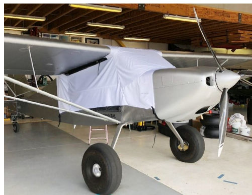
Rans S-20 Canopy Cover, test fit cover