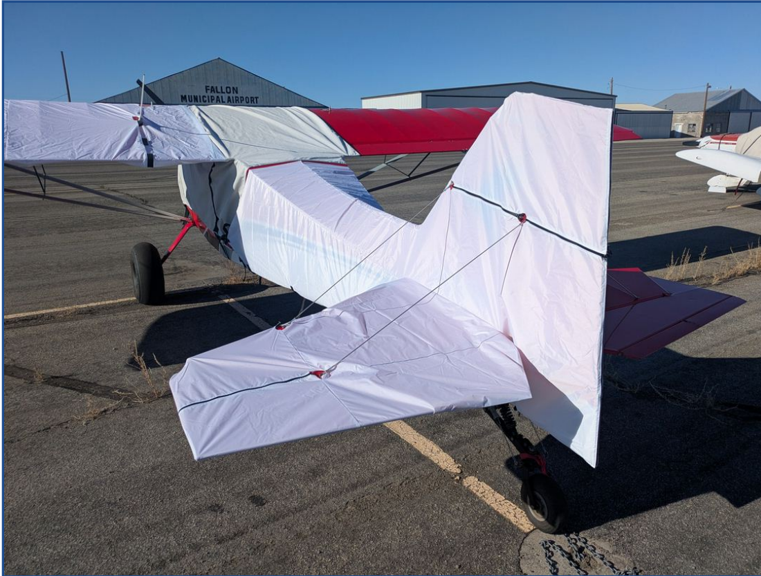
Rans S-20 Raven Canopy Cover, Wing Covers &amp; Empennage Cover (some test fit)