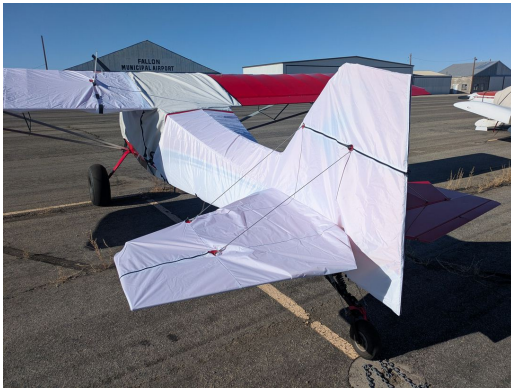
Rans S-20 Raven Canopy Cover, Wing Covers & Empennage Cover (some test fit)

WINTER USE MATERIAL - Made with Solution-Dyed Polyester fabric, this option is intended for seasonal use to aid in deicing, rain mitigation, or for occasional travel. The material is lighter and more compact, but more susceptible to UV damage and may have a shorter useful life if used continuously outside than the all-year use material.