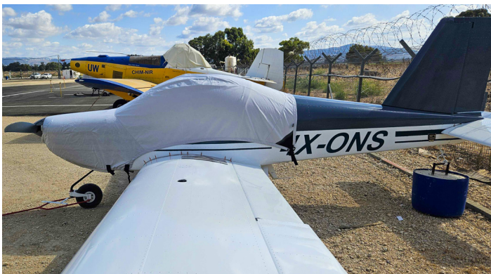
Rans S-19 Canopy/Engine Cover

This cover type is made from Silver Acrylic Sunbrella canvas and is 100% lined with a soft and smooth microfiber. Bruce's Custom Covers developed this material combination especially for aircraft protection. The outer material is medium weight and treated for water resistance, UV resistance and anti-static buildup. The inner lining is a very soft and smooth microfiber to prevent scratching. The material is very reflective, and tests show that the cabin interior temperature can be reduced to near-ambient temperature on the hottest of days. It is water, ice and snow repellent, yet breathable to allow moisture to escape from between the cover and the aircraft surface.