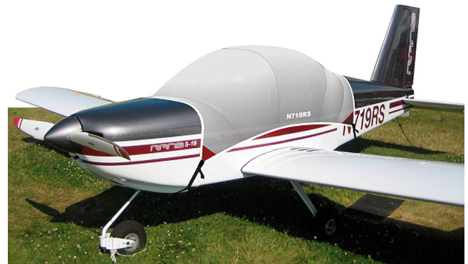
Rans S-19 Canopy Cover (illustration)