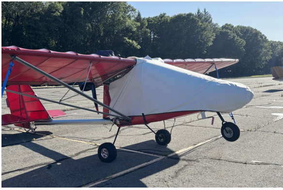
Rans S-12/14 Airaile Canopy/Nose Cover