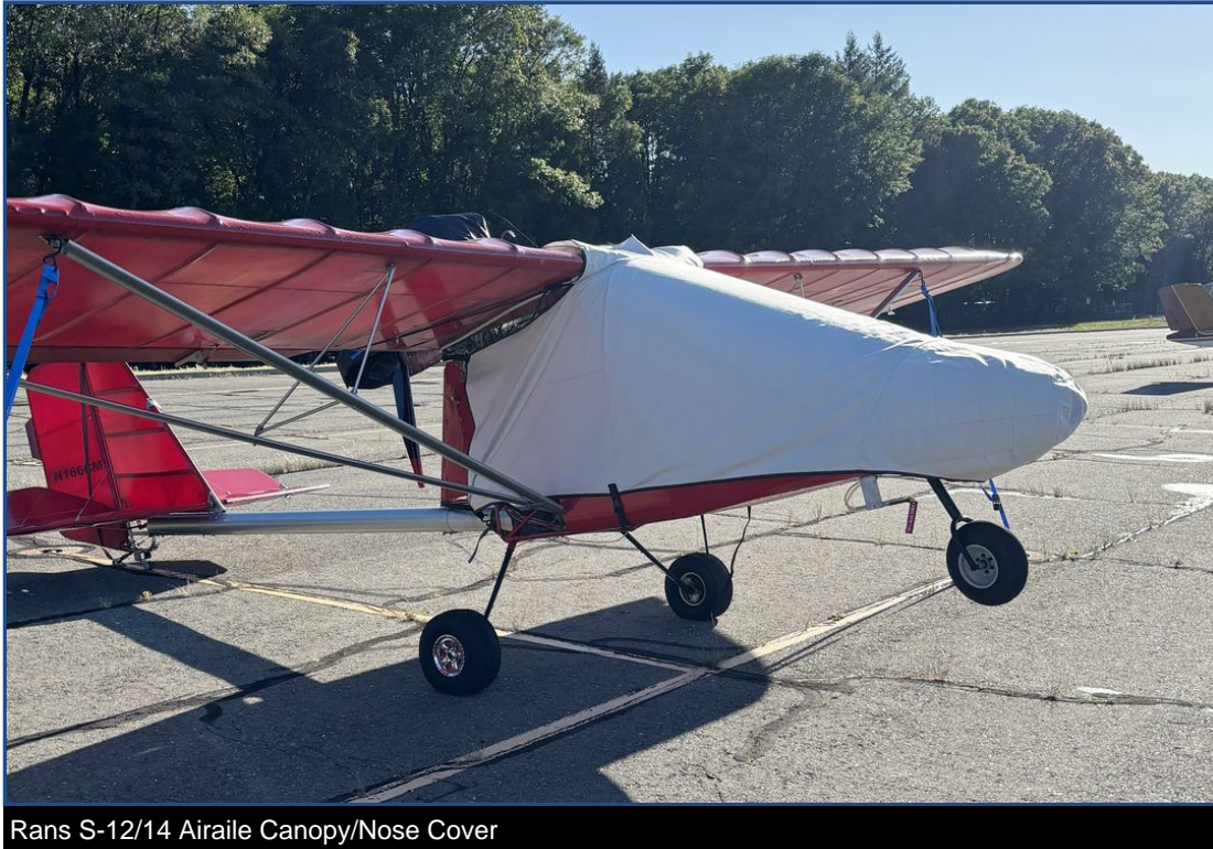
Rans S-12/14 Airaile Canopy/Nose Cover