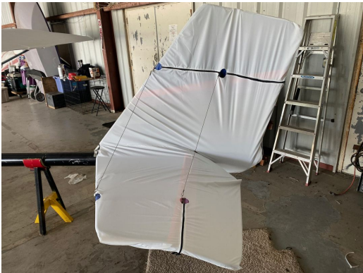
Rans S-12 Empennage Cover, test fit