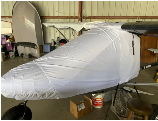
Rans S-12 Canopy/Nose Cover, test fit