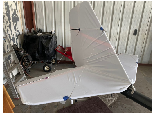
Rans S-12 Empennage Cover, test fit