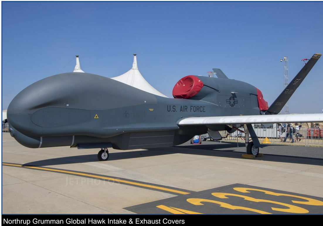
Northrop Grumman Global Hawk Intake & Exhaust Covers