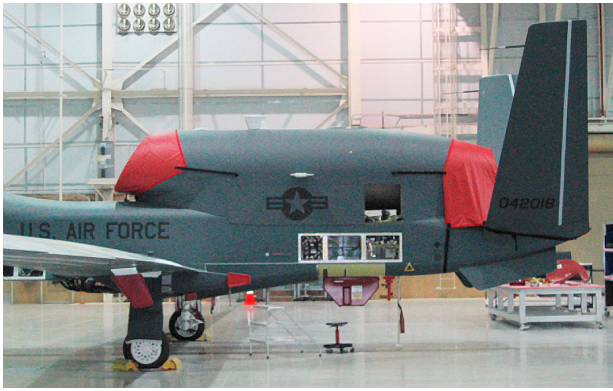
Global Hawk Intake & Exhaust Covers