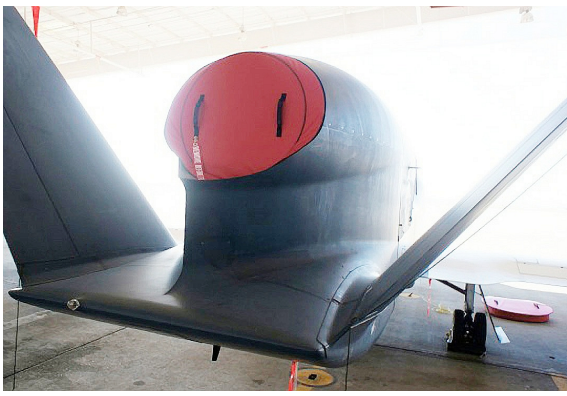
RQ-4/MQ-4 Global Hawk Exhaust Plug w/ lip (Fits both A & B models & all blocks)