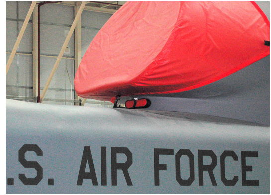
Intake Cover with small inlet plug