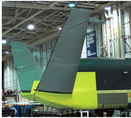
Global Hawk V-tail Stabilizer Covers