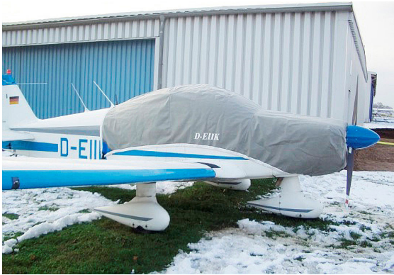
Robin R.2160 Canopy/Engine Cover

This cover type is made from Silver Acrylic Sunbrella canvas and is 100% lined with a soft and smooth microfiber. Bruce's Custom Covers developed this material combination especially for aircraft protection. The outer material is medium weight and treated for water resistance, UV resistance and anti-static buildup. The inner lining is a very soft and smooth microfiber to prevent scratching. The material is very reflective, and tests show that the cabin interior temperature can be reduced to near-ambient temperature on the hottest of days. It is water, ice and snow repellent, yet breathable to allow moisture to escape from between the cover and the aircraft surface.