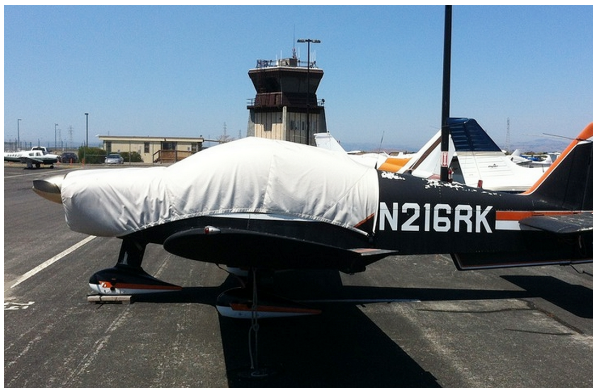
Robin Canopy/Engine Cover

Travel Covers are made with Silver Solution-Dyed Polyester fabric and only lined over the windshield to save weight. The material is lightweight and more compact for easy stowage in the aircraft. The polyester material is water resistant, but only intended for occasional use outside. We also have an ultra lightweight material available for fitted hangar dust covers. For daily outdoor use, the non-travel Sunbrella Cover is the best choice.