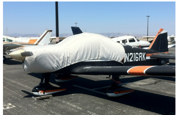
Robin Canopy/Engine Cover