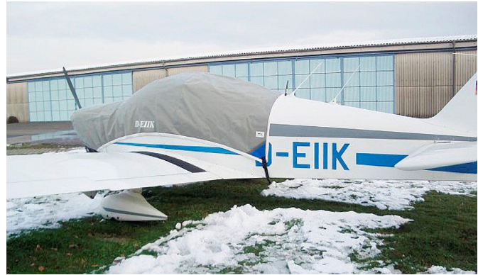
Robin R.2160 Canopy/Engine Cover