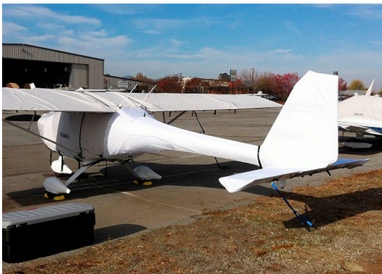
Remos Empennage Cover (test fit cover)

WINTER USE MATERIAL - Made with Solution-Dyed Polyester fabric, this option is intended for seasonal use to aid in deicing, rain mitigation, or for occasional travel. The material is lighter and more compact, but more susceptible to UV damage and may have a shorter useful life if used continuously outside than the all-year use material.