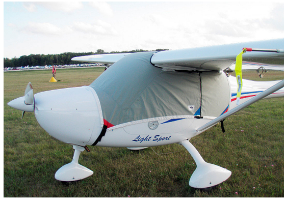
Remos G3 Travel Weight Canopy Cover