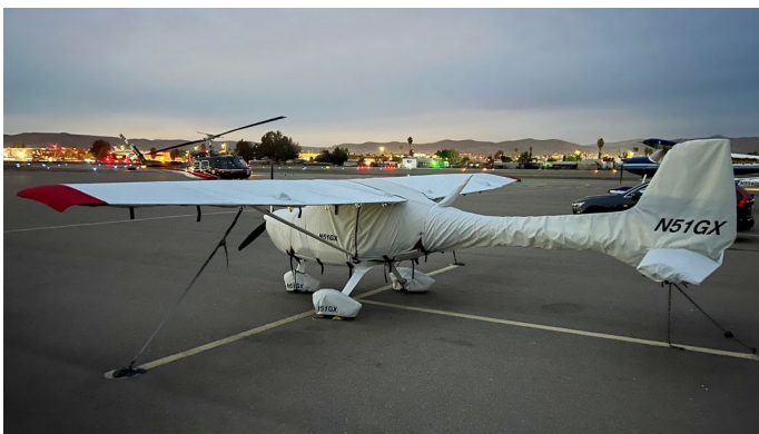
Remos RG-3 Complete Cover Set

WINTER USE MATERIAL - Made with Solution-Dyed Polyester fabric, this option is intended for seasonal use to aid in deicing, rain mitigation, or for occasional travel. The material is lighter and more compact, but more susceptible to UV damage and may have a shorter useful life if used continuously outside than the all-year use material.