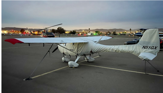
Remos RG-3 Complete Cover Set

ALL-YEAR USE MATERIAL - Made with Silver Acrylic Sunbrella canvas, the all-year use material is the best option for sun protection and cover longevity. This heavier more durable material is intended for all weather conditions, such as rain and snow or lots of sun.