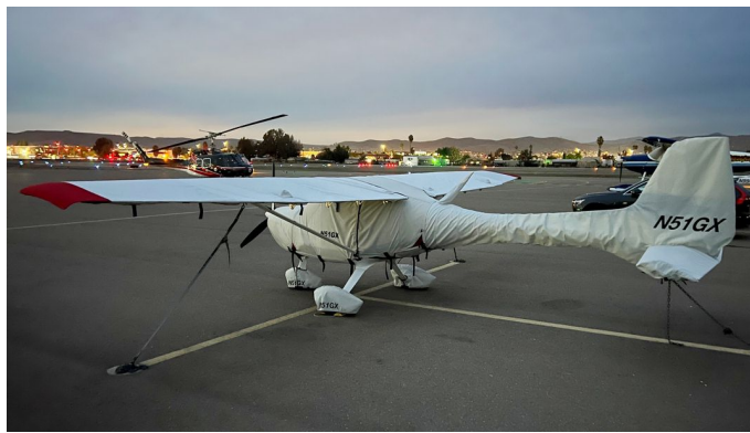
Remos RG-3 Complete Cover Set