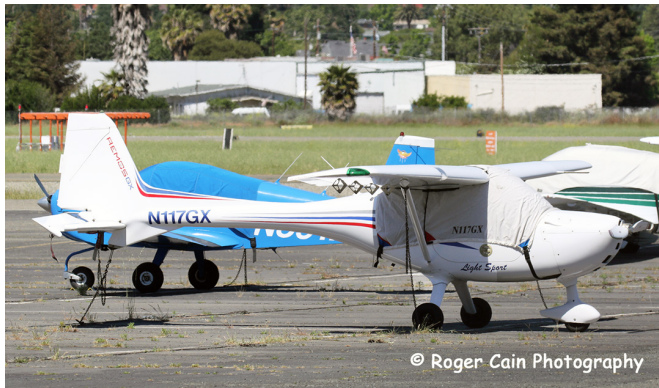
Remos GX Canopy Cover

This cover type is made from Silver Acrylic Sunbrella canvas and is 100% lined with a soft and smooth microfiber. Bruce's Custom Covers developed this material combination especially for aircraft protection. The outer material is medium weight and treated for water resistance, UV resistance and anti-static buildup. The inner lining is a very soft and smooth microfiber to prevent scratching. The material is very reflective, and tests show that the cabin interior temperature can be reduced to near-ambient temperature on the hottest of days. It is water, ice and snow repellent, yet breathable to allow moisture to escape from between the cover and the aircraft surface.