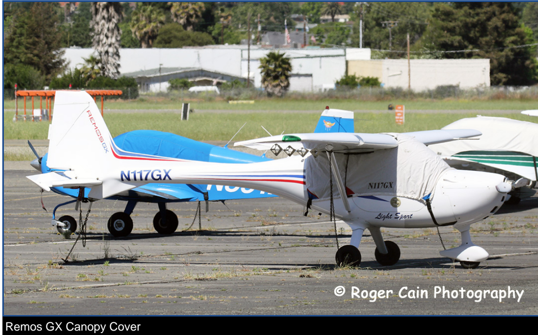
Remos GX Canopy Cover