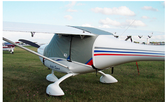
Remos G3 Travel Weight Canopy Cover