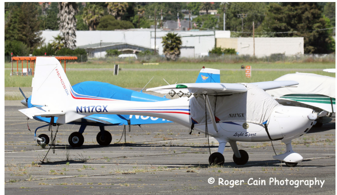
Remos GX Canopy Cover