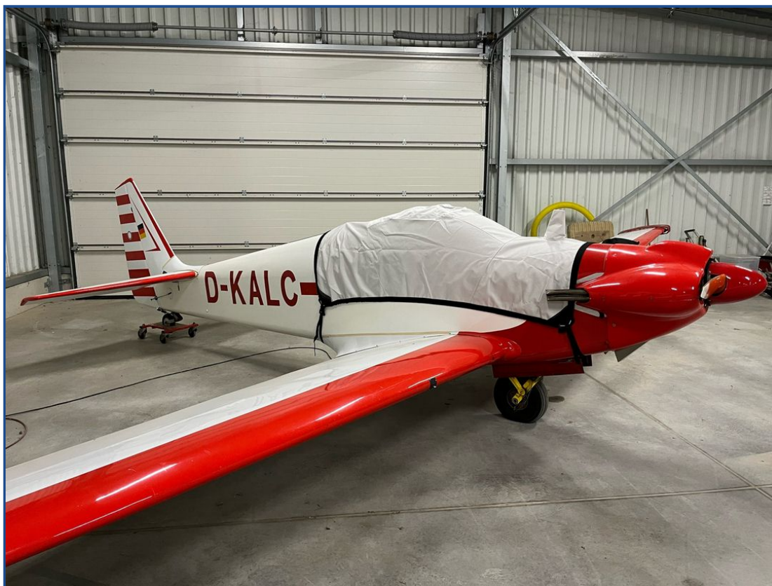
Fournier RF-4D Motorglider Canopy Cover