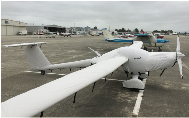
Distar Sundancer LSA Extended Canopy/Engine, Prop, Wheelpants, Wings & Empennage Covers