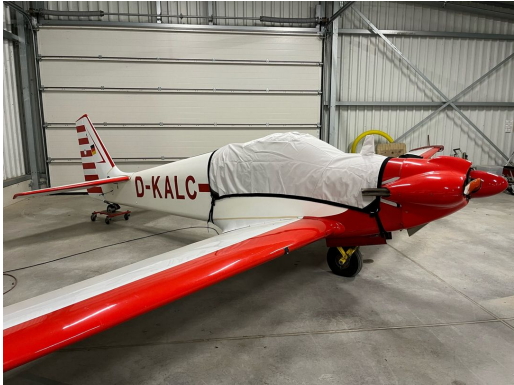
Fournier RF-4D Motorglider Canopy Cover