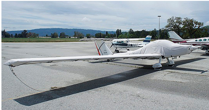
Grob 109 Canopy/Engine w/ extension to tail, Wing, Stabilizer & Prop/Spinner Covers