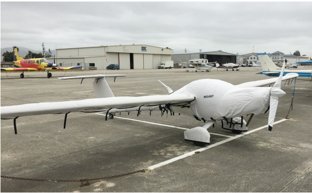
Distar Sundancer LSA Extended Canopy/Engine, Prop, Wheelpants, Wings & Empennage Covers

WINTER USE MATERIAL - Made with Solution-Dyed Polyester fabric, this option is intended for seasonal use to aid in deicing, rain mitigation, or for occasional travel. The material is lighter and more compact, but more susceptible to UV damage and may have a shorter useful life if used continuously outside than the all-year use material.