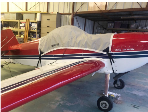
IAC One Design Travel Weight Canopy Cover

Travel Covers are made with Silver Solution-Dyed Polyester fabric and only lined over the windshield to save weight. The material is lightweight and more compact for easy stowage in the aircraft. The polyester material is water resistant, but only intended for occasional use outside. We also have an ultra lightweight material available for fitted hangar dust covers. For daily outdoor use, the non-travel Sunbrella Cover is the best choice.