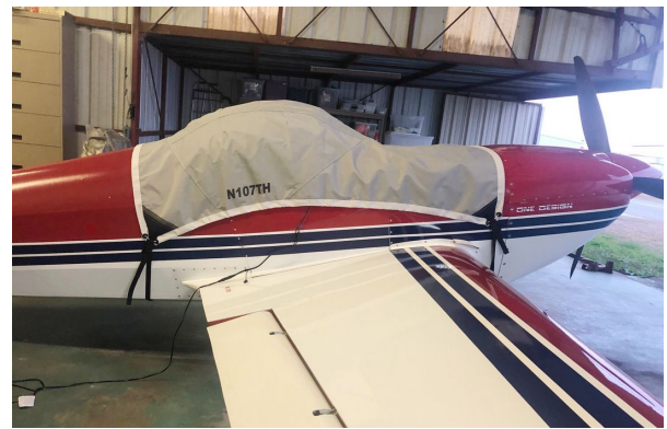
IAC One Design Travel Weight Canopy Cover