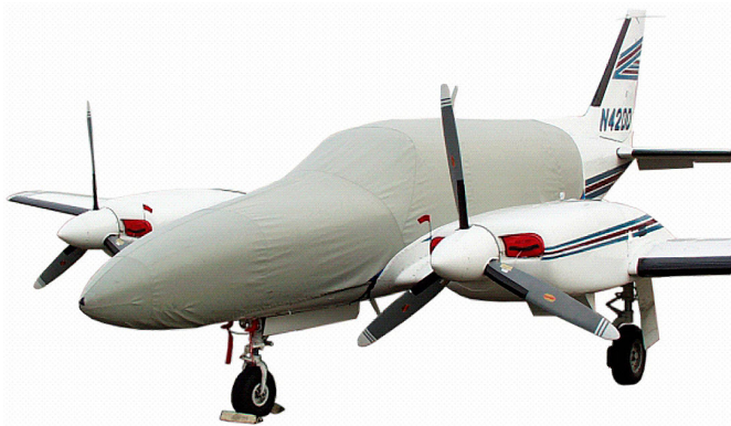
Piper Navajo CR Canopy/Nose Cover

This cover type is made from Silver Acrylic Sunbrella canvas and is 100% lined with a soft and smooth microfiber. Bruce's Custom Covers developed this material combination especially for aircraft protection. The outer material is medium weight and treated for water resistance, UV resistance and anti-static buildup. The inner lining is a very soft and smooth microfiber to prevent scratching. The material is very reflective, and tests show that the cabin interior temperature can be reduced to near-ambient temperature on the hottest of days. It is water, ice and snow repellent, yet breathable to allow moisture to escape from between the cover and the aircraft surface.