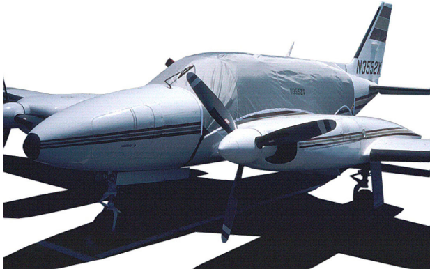
Piper Navajo Canopy Cover