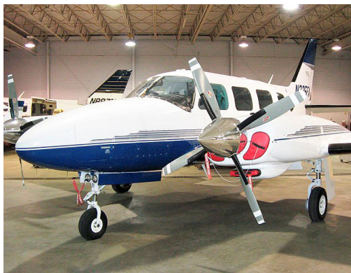
Piper Navajo PA31 Engine Inlet Plugs (Panther Conversion)