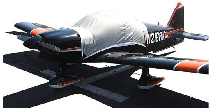
Robin Canopy Cover (R.2160 shown)