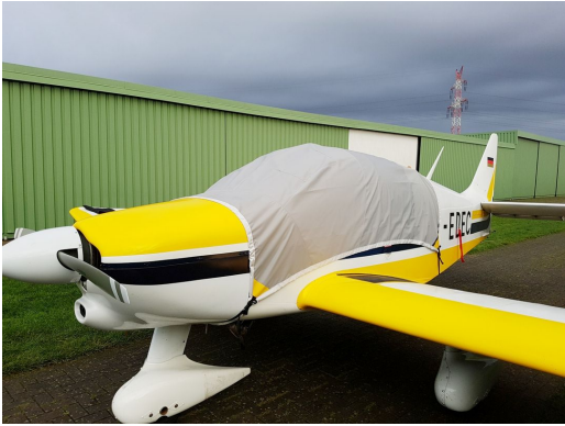
Robin DR400/R Travel Cover, Light Weight Travel Canopy Cover

Canopy Covers are commonly referred to as Cabin Covers, Fuselage Covers, Canvas Covers, Canopy Caps, etc.