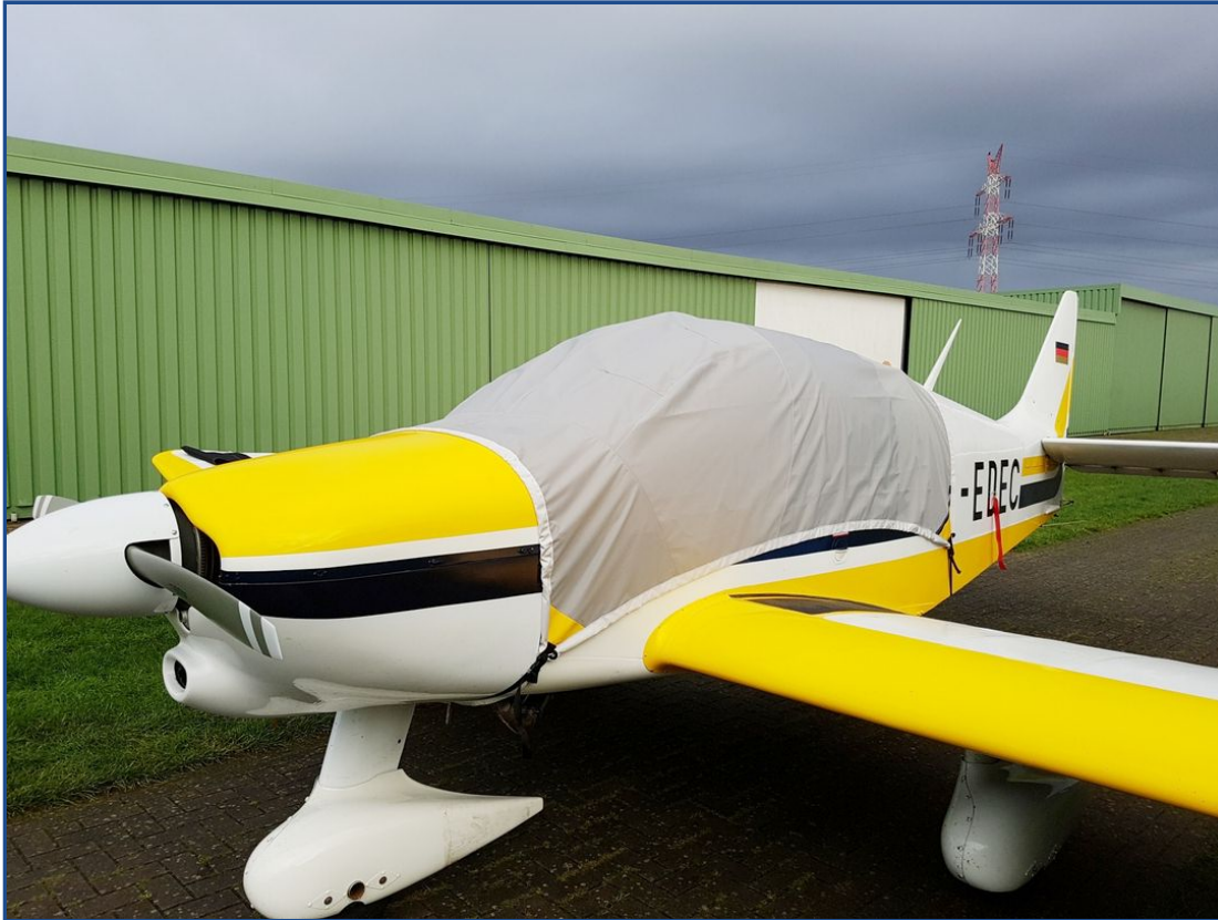
Robin DR400/R Travel Cover, Light Weight Travel Canopy Cover