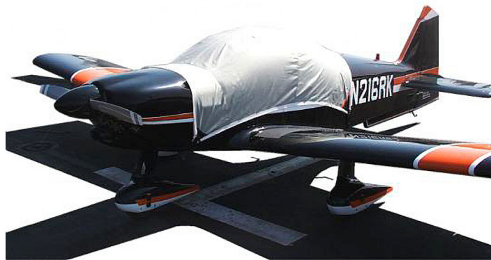
Robin Canopy Cover (R.2160 shown)

Travel Covers are made with Silver Solution-Dyed Polyester fabric and only lined over the windshield to save weight. The material is lightweight and more compact for easy stowage in the aircraft. The polyester material is water resistant, but only intended for occasional use outside. We also have an ultra lightweight material available for fitted hangar dust covers. For daily outdoor use, the non-travel Sunbrella Cover is the best choice.