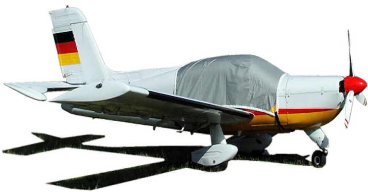
Rallye 150 Canopy Cover