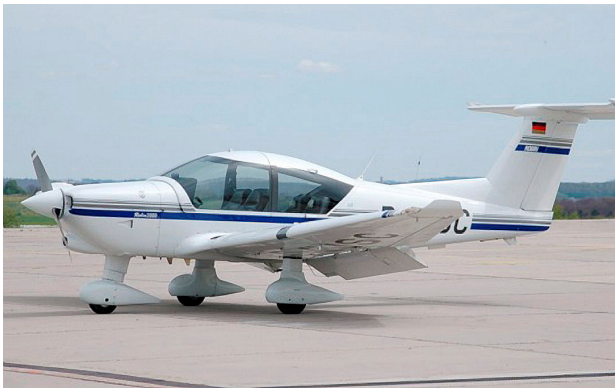
Canopy Cover for the Robin 3140 & R-3000

the hottest of days. It is water, ice and snow repellent, yet breathable to allow moisture to escape from between the cover and the aircraft surface.