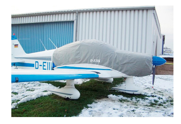
Robin R.2160 Canopy/Engine Cover