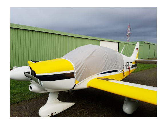
Robin DR400/R Travel Cover, Light Weight Travel Canopy Cover

This cover type is made from Silver Acrylic Sunbrella canvas and is 100% lined with a soft and smooth microfiber. Bruce's Custom Covers developed this material combination especially for aircraft protection. The outer material is medium weight and treated for water resistance, UV resistance and anti-static buildup. The inner lining is a very soft and smooth microfiber to prevent scratching. The material is very reflective, and tests show that the cabin interior temperature can be reduced to near-ambient temperature on the hottest of days. It is water, ice and snow repellent, yet breathable to allow moisture to escape from between the cover and the aircraft surface.