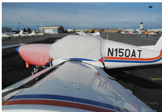
Koliber 150A Canopy Cover, Insulated Engine Cover