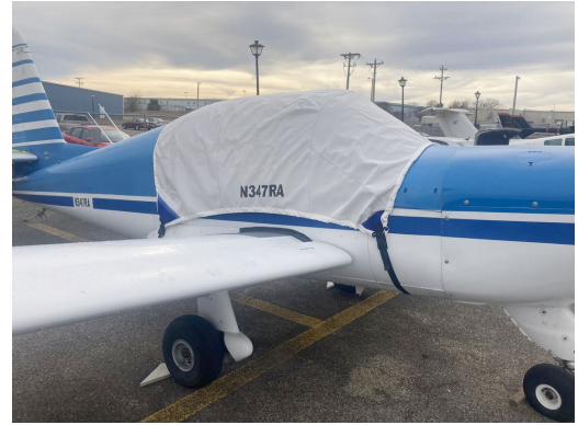
SOCATA Rallye 150 Canopy Cover