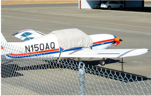
Kolibier 150-A Canopy Cover

The Aerospatiale (Socata) Rallye 150 Canopy/Engine Cover is a one-piece cover (100% lined with microfiber) that is a combination of the Canopy Cover and Engine Cover. This cover will enclose the engine cowl and will extend aft to cover all of the windows. This cover type is made from Silver Acrylic Sunbrella canvas and is 100% lined with a soft and smooth microfiber. Bruce's Custom Covers developed this material combination especially for aircraft protection. The outer material is medium weight and treated for water resistance, UV resistance and anti-static buildup. The inner lining is a very soft and smooth microfiber to prevent scratching. The material is very reflective, and tests show that the cabin interior temperature can be reduced to near-ambient temperature on the hottest of days. It is water, ice and snow repellent, yet breathable to allow moisture to escape from between the cover and the aircraft surface.