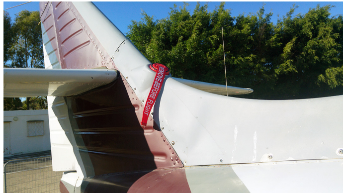
Rockwell Aero Commander 112, 114 Engine Inlet Plugs (114 Model)