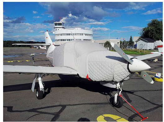
Rockwell Commander 114 Extended Canopy, Insulated Engine, Wing Covers