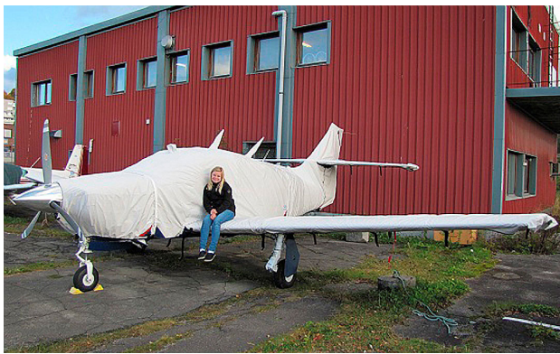
Rockwell Commander Engine, Extended Canopy, Wings, & Empennage Covers