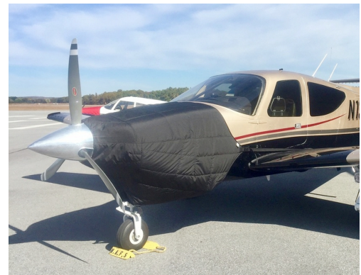
Rockwell Aero Commander Insulated Engine Cover