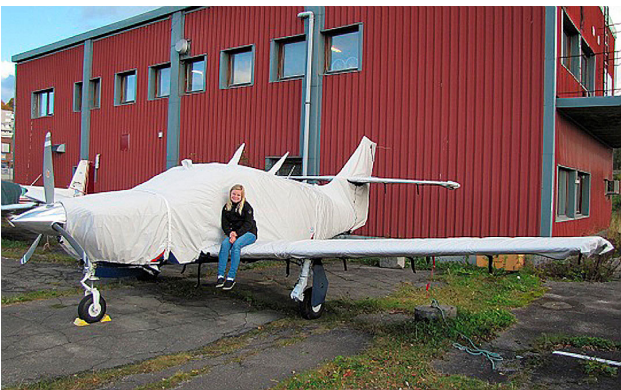
Rockwell Commander Engine, Extended Canopy, Wings, & Empennage Covers