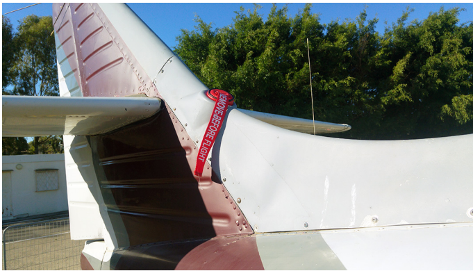
Rockwell Aero Commander 112, 114 Engine Inlet Plugs (114 Model)

Engine Inlet Plugs are custom fit for your Rockwell Aero Commander 112, 114 intakes, made with heavy-duty vinyl material, and stuffed with a single block of sculpted urethane foam. Each plug has a zipper that allows the foam to be removed and dried if necessary. Engine plugs have warning flags that are visible from the cockpit or 'remove before flight' streamers sewn onto the face of the plugs. Most plugs are imprinted with the aircraft registration number in black for an extra charge. Storage bag NOT included. Engine plugs may be inserted after flight when the engine is still warm. Engine Inlet Plugs are commonly referred to as Cowl Plugs, Intake Plugs, Cowl Blocks, Engine Blocks, and Engine Bungs.