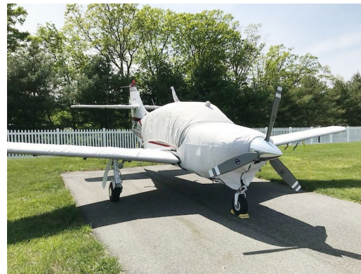
Rockwell Commander 114A Canopy, Engine, Wings & Horizontal Stab. Covers