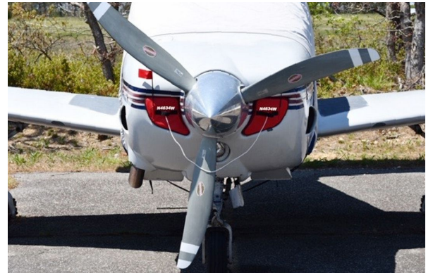
Rockwell 114 Engine Plugs