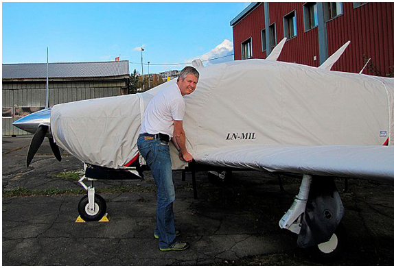
Rockwell Commander 114 Full Cover Set