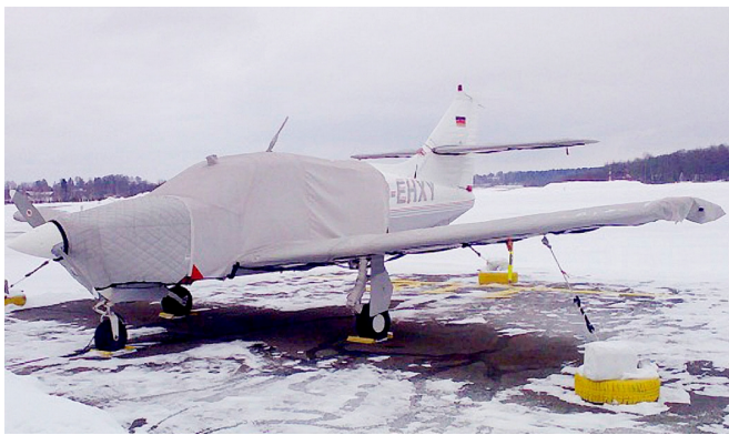
Rockwell Commander Extended Canopy Cover, Insulated Engine Cover, Wing & Tail Covers