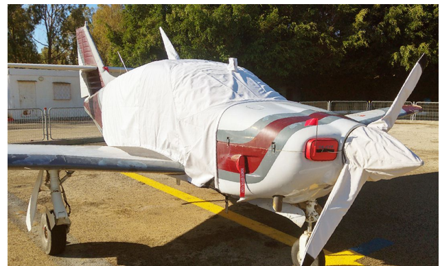
Rockwell Aero Commander 112, 114 Extended Canopy Cover