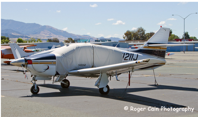
Rockwell Aero Commander 112 Extended Canopy Cover

This cover type is made from Silver Acrylic Sunbrella canvas and is 100% lined with a soft and smooth microfiber. Bruce's Custom Covers developed this material combination especially for aircraft protection. The outer material is medium weight and treated for water resistance, UV resistance and anti-static buildup. The inner lining is a very soft and smooth microfiber to prevent scratching. The material is very reflective, and tests show that the cabin interior temperature can be reduced to near-ambient temperature on the hottest of days. It is water, ice and snow repellent, yet breathable to allow moisture to escape from between the cover and the aircraft surface.