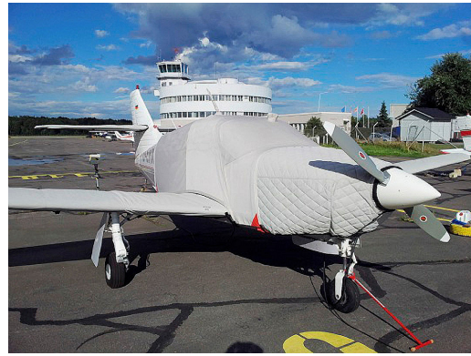
Rockwell Commander 114 Extended Canopy, Insulated Engine, Wing Covers