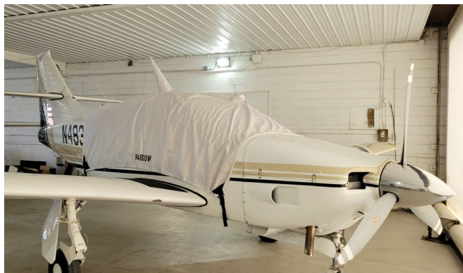
Rockwell Aero Commander 114 Canopy Cover

This cover type is made from Silver Acrylic Sunbrella canvas and is 100% lined with a soft and smooth microfiber. Bruce's Custom Covers developed this material combination especially for aircraft protection. The outer material is medium weight and treated for water resistance, UV resistance and anti-static buildup. The inner lining is a very soft and smooth microfiber to prevent scratching. The material is very reflective, and tests show that the cabin interior temperature can be reduced to near-ambient temperature on the hottest of days. It is water, ice and snow repellent, yet breathable to allow moisture to escape from between the cover and the aircraft surface.