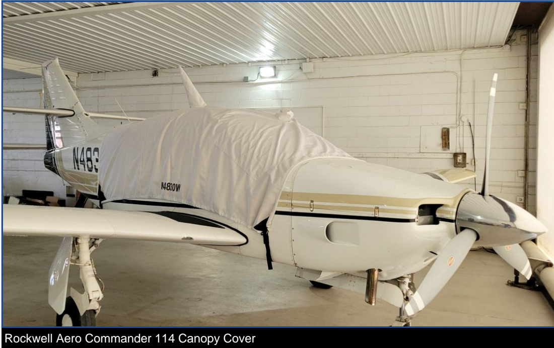
Rockwell Aero Commander 114 Canopy Cover