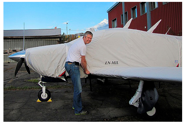
Rockwell Commander 114 Full Cover Set