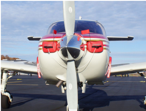
Rockwell Aero Commander 112, 114 Engine Inlet Plugs (112 Model)

Engine Inlet Plugs are custom fit for your Rockwell Aero Commander 112, 114 intakes, made with heavy-duty vinyl material, and stuffed with a single block of sculpted urethane foam. Each plug has a zipper that allows the foam to be removed and dried if necessary. Engine plugs have warning flags that are visible from the cockpit or 'remove before flight' streamers sewn onto the face of the plugs. Most plugs are imprinted with the aircraft registration number in black for an extra charge. Storage bag NOT included. Engine plugs may be inserted after flight when the engine is still warm. Engine Inlet Plugs are commonly referred to as Cowl Plugs, Intake Plugs, Cowl Blocks, Engine Blocks, and Engine Bunges.