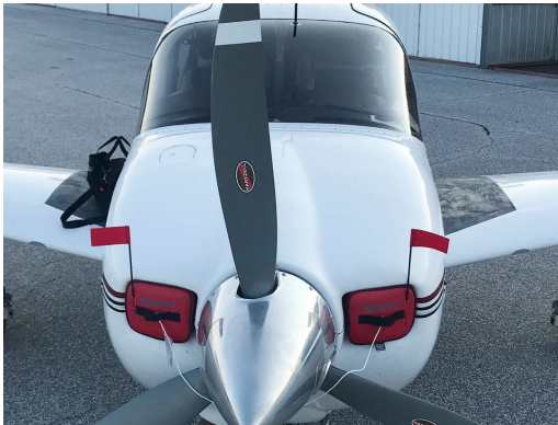
Aero Commander 112 Engine Inlet Plugs

Engine Inlet Plugs are custom fit for your Rockwell Aero Commander 112, 114 intakes, made with heavy-duty vinyl material, and stuffed with a single block of sculpted urethane foam. Each plug has a zipper that allows the foam to be removed and dried if necessary. Engine plugs have warning flags that are visible from the cockpit or 'remove before flight' streamers sewn onto the face of the plugs. Most plugs are imprinted with the aircraft registration number in black for an extra charge. Storage bag NOT included. Engine plugs may be inserted after flight when the engine is still warm. Engine Inlet Plugs are commonly referred to as Cowl Plugs, Intake Plugs, Cowl Blocks, Engine Blocks, and Engine Bunges.