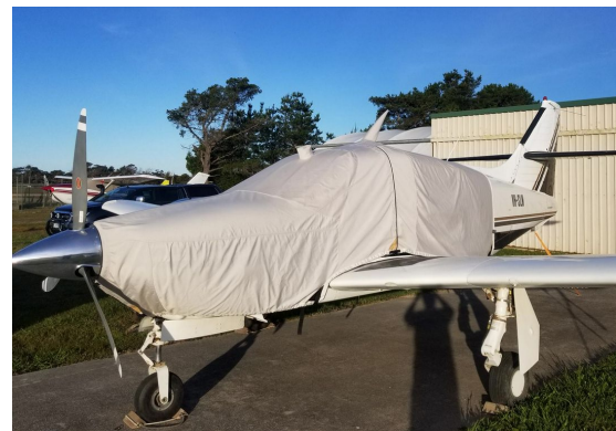
Rockwell Aero Commander 112, 114 Extended Canopy/Engine Cover