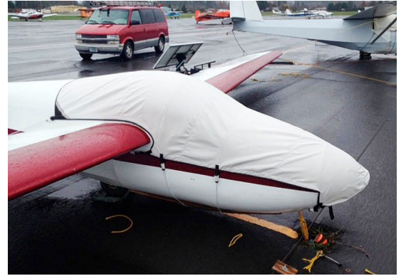
SGS 1-26B Canopy/Nose Cover