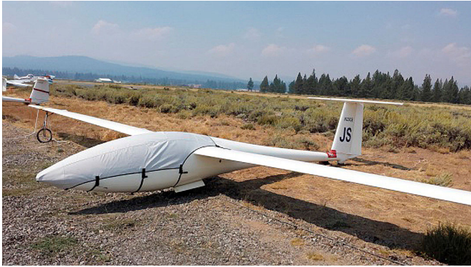
ASW-20C Canopy/Nose Cover

Covers developed this material combination especially for aircraft protection. The outer material is medium weight and treated for water resistance, UV resistance and anti-static buildup. The inner lining is a very soft and smooth microfiber to prevent scratching. The material is very reflective, and tests show that the cabin interior temperature can be reduced to near-ambient temperature on the hottest of days. It is water, ice and snow repellent, yet breathable to allow moisture to escape from between the cover and the aircraft surface.