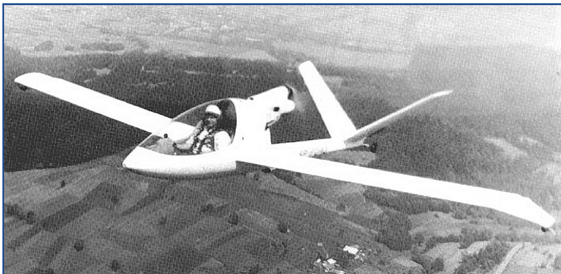
Canopy/Engine Cover for the J-5 Marco