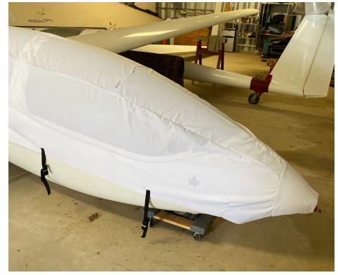
PZL Swidnik PW6 Canopy/Nose Cover