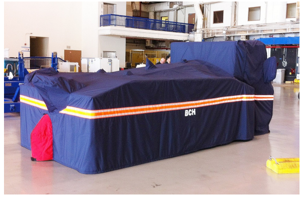
Complete Cover for Eagle Tug