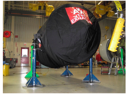
PW JT8D Off-Link Engine Transport Cover (no nose cone, no TR's), fully enclosed