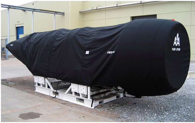
PW JT8D Off-Link Protective Long-term Storage "Rain Cap" Style Engine Cover