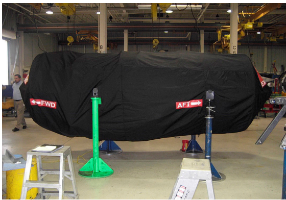
PW JT8D Off-Link Engine Transport Cover (no nose cone, no TR's), fully enclosed