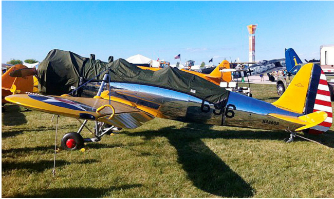
Ryan PT-22 ST3KR Canopy Cover and Engine Cover

This cover type is made from Silver Acrylic Sunbrella canvas and is 100% lined with a soft and smooth microfiber. Bruce's Custom Covers developed this material combination especially for aircraft protection. The outer material is medium weight and treated for water resistance, UV resistance and anti-static buildup. The inner lining is a very soft and smooth microfiber to prevent scratching. The material is very reflective, and tests show that the cabin interior temperature can be reduced to near-ambient temperature on the hottest of days. It is water, ice and snow repellent, yet breathable to allow moisture to escape from between the cover and the aircraft surface.