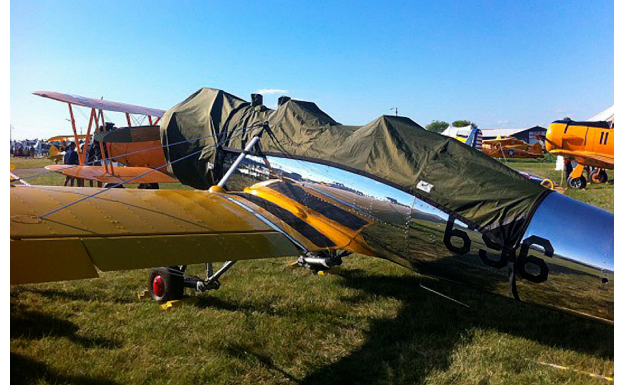
Ryan PT-22 Canopy Cover and Engine Cover