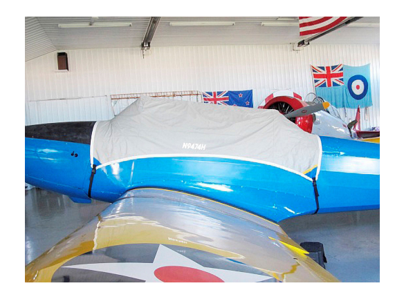
Fairchild PT-26 Canopy Cover

Travel Covers are made with Silver Solution-Dyed Polyester fabric and only lined over the windshield to save weight. The material is lightweight and more compact for easy stowage in the aircraft. The polyester material is water resistant, but only intended for occasional use outside. We also have an ultra lightweight material available for fitted hangar dust covers. For daily outdoor use, the non-travel Sunbrella Cover is the best choice.