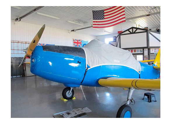
Fairchild PT-26 Canopy Cover