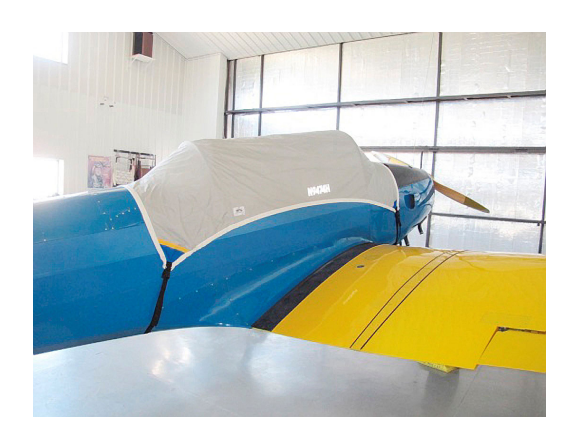
Fairchild PT-26 Canopy Cover