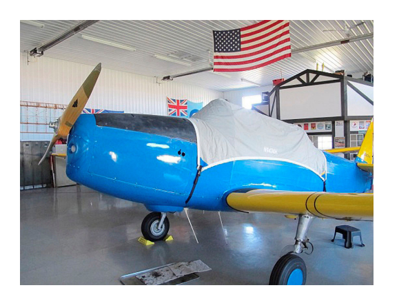
Fairchild PT-26 Canopy Cover