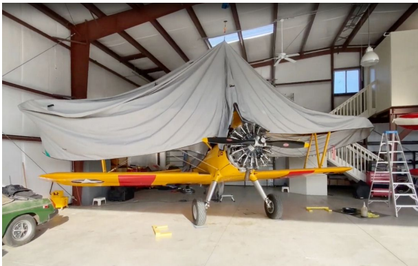
#7: Easy, one-person installation.

Some high value aircraft end up logging lots of hangar time, and become dust magnets in the process. A high quality, well fitting dust cover provides easy assurance that the aircraft's surfaces remain clean and free of grit and grime. Available in a large variety of colors, each dust cover is custom made according to aircraft details and customer preferences. Fire retardant fabrics are also available.