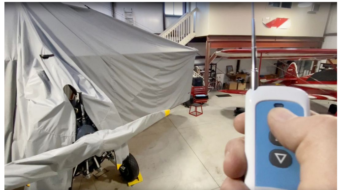
#5: Wireless hoist control.