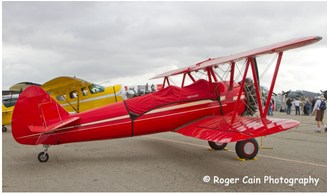
Stearman PT-13 Canopy Cover

the hottest of days. It is water, ice and snow repellent, yet breathable to allow moisture to escape from between the cover and the aircraft surface.