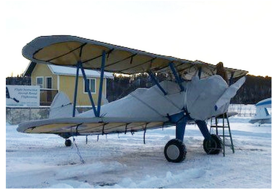
Boeing Stearman PT-13 Winter Cover Set