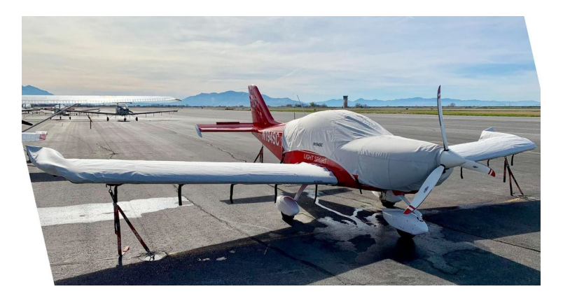
Czech Sport Canopy/Engine & Wing Covers