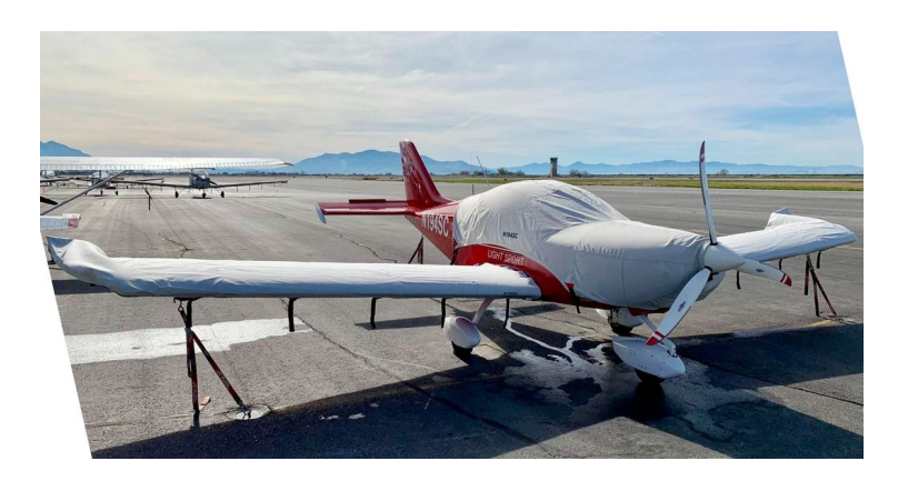
Czech Sport Canopy/Engine & Wing Covers

WINTER USE MATERIAL - Made with Solution-Dyed Polyester fabric, this option is intended for seasonal use to aid in deicing, rain mitigation, or for occasional travel. The material is lighter and more compact, but more susceptible to UV damage and may have a shorter useful life if used continuously outside than the all-year use material.