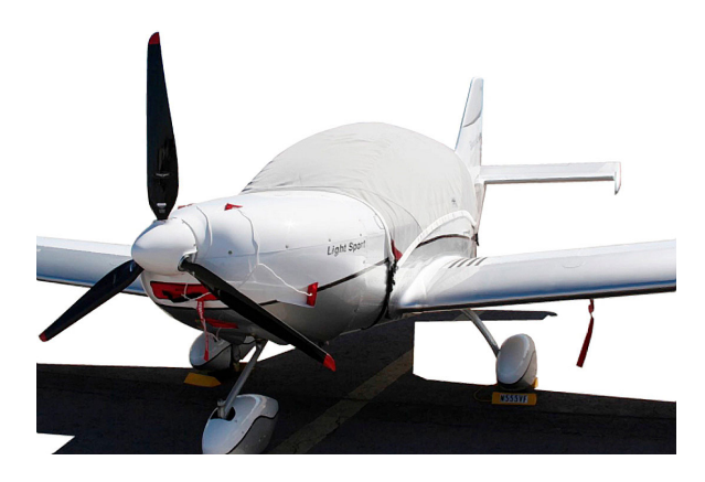
Sportcruiser Canopy Cover & Plugs

have warning flags that are visible from the cockpit or 'remove before flight' streamers sewn onto the face of the plugs. Most plugs are imprinted with the aircraft registration number in black for an extra charge. Storage bag NOT included. Engine plugs may be inserted after flight when the engine is still warm. Engine Inlet Plugs are commonly referred to as Cowl Plugs, Intake Plugs, Cowl Blocks, Engine Blocks, and Engine Bungs.