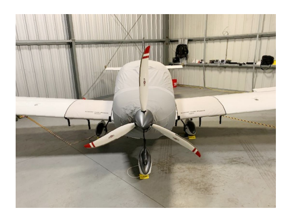
Czech Sport Travel Light Weight Canopy/Engine Cover, Wing Locker Covers