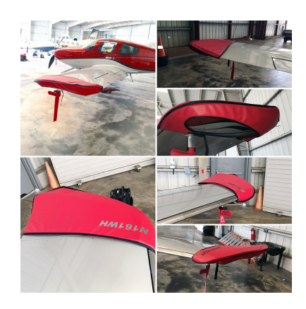
Cirrus SR22 Wingtip Pads, G5 Models

Designed to prevent damage to the aircraft extremities in crowded hangars, these products are made of bright red Naugahyde and thickly padded with a sandwich of closed cell foam.