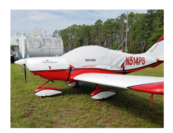
PiperSport Canopy Cover

This cover type is made from Silver Acrylic Sunbrella canvas and is 100% lined with a soft and smooth microfiber. Bruce's Custom Covers developed this material combination especially for aircraft protection. The outer material is medium weight and treated for water resistance, UV resistance and anti-static buildup. The inner lining is a very soft and smooth microfiber to prevent scratching. The material is very reflective, and tests show that the cabin interior temperature can be reduced to near-ambient temperature on the hottest of days. It is water, ice and snow repellent, yet breathable to allow moisture to escape from between the cover and the aircraft surface.